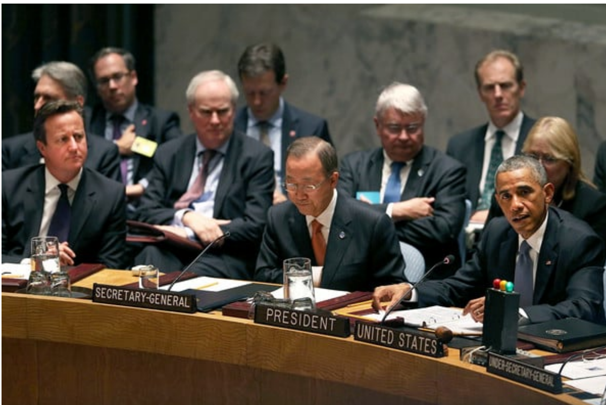
United Nations Security Council Meeting, September 24, 2014, chaired by president Obama

The United Nations Security Council resolution calls upon member states to “suppress the recruiting, organizing, transporting, equipping” and financing of foreign terrorist fighters,” Specifically, the resolution points to the “the particular and urgent need to implement this resolution with respect to those foreign terrorist fighters who are associated with ISIL [Islamic State of Iraq and the Levant], ANF [Al-Nusrah Front] and other cells, affiliates, splinter groups or derivatives of Al-Qaida...” But are these not precisely the “opposition freedom fighters” trained and recruited by the Western military alliance in their quest to unseat the government of Bashar Al Assad?