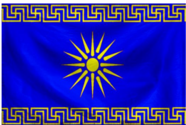
The flag of Greek Macedonia (the Aegean Macedonia) with the Sun of Vergina

In 1993 several states recognized Macedonia under the official state-name as the FYROM but there were also and those states who recognized the country as the Republic of Macedonia. Macedonia was recognized by six EU members followed by the United States of America (the US) and Australia by early 1994. However, the Greek Government experienced Macedonia’s recognition of independence without the final fixing the question of Macedonia’s administrative name for the external usage as her own great diplomatic and national defeat, and as a response to such situation, Athens imposed a strict trade embargo to the FYROM on February 17 th , 1994 for the sake to more firmly point out its unchanged position regarding several problematic issues in dealing with its northern neighbour. The embargo had a very large, and negative, impact on Macedonia’s economy as its export earnings became reduced by 85% and its food supplies dropped by 40%. On the other side, the economic blockade was very much criticised by the international community including and the EU and, therefore, not much later became lifted in 1995, but after successful negotiations between Greece and the FYROM, when these two countries finally recognized each other and established diplomatic relations. The FYROM, as a part of a settlement package with Greece, was also forced to change the official flag of the state on which the “Sun of Vergina” was replaced with the “Macedonian Sun”. [17]