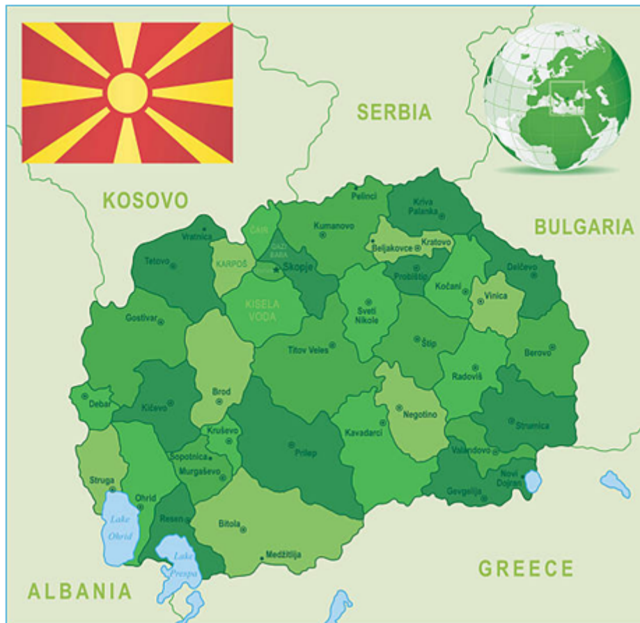
The FYROM (the Republic of Macedonia)