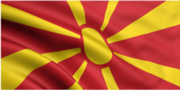
The FYROM flag from 1995

The proclamation of state independence of the Yugoslav portion of Macedonia under the official name the Republic of Macedonia immediately created an extremely tense relationship with the neighbouring Greece as Macedonia developed rival claims for ethnicity and statehood followed by the appropriation of the ancient Macedonian history and culture. This Greco-Macedonian rivalry became firstly epitomized in a dispute on Macedonia's official state-name for the very reason that Greece objected to the use of the term Macedonia in any combination of the name of the state of its northern neighbour.