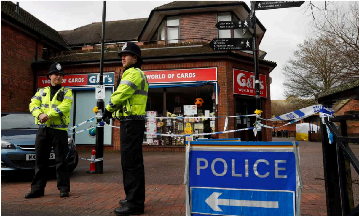
▲ A police cordon in Salisbury, where the former Russian spy Sergei Skripal and his daughter, Yulia, were found critically ill on a bench on 4 March.

Boris Johnson under pressure to explain whether position has changed after tweet blaming Moscow is deleted