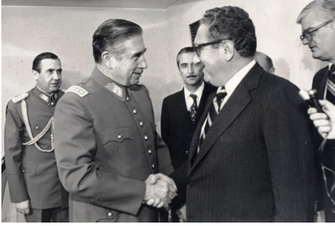
Flash back to Chile, September 11 1973.

As a visiting professor at the Catholic University of Chile, I lived through the military coup directed against the democratically elected government of Salvador Allende . It was a CIA op led by Secretary of State Henry Kissinger coupled with devastating macro-economic reforms.