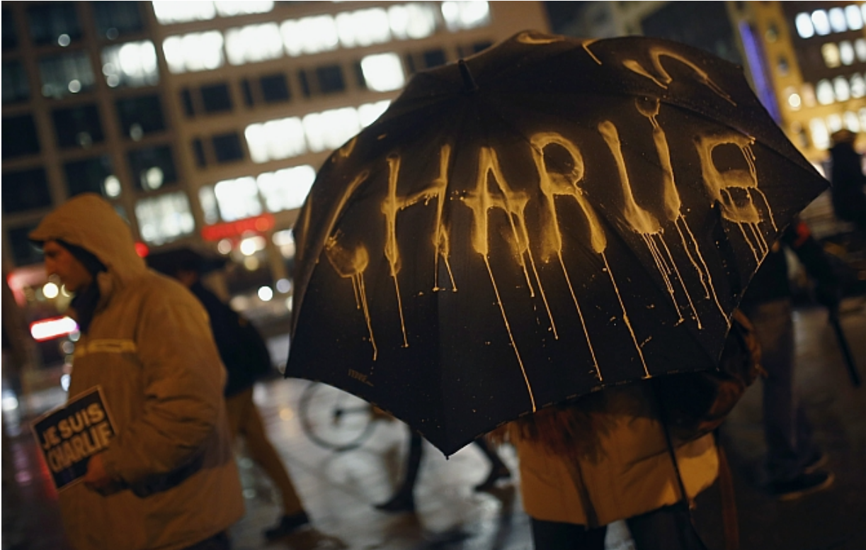
Image: ‘WHO WATCHES THE WATCHMEN?’ – Social media propoganda went global following the Paris attacks this past January, centering the public’s focus on ‘freedom of speech’ while alarming details of the case were glossed over.

“the ATF believes that someone purchased this gun on behalf of the police department and somehow that gun ended up in the hands of this guy.”