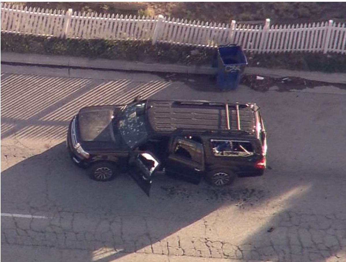
Image: 'BOTCHED GETAWAY' - Although authorities obtained a paper trail for the rented SUV above - but there are still many questions surrounding those said to be driving the vehicle. Why isn't there footage of the alleged 'terror couple' leaving the SUV?

San Bernardino, along with staged-managed events like the sensational Garland Shooting in April 2015, and the highly engineered Paris Attacks (January & November of 2015) and many othershootings this year and year's past - have conveniently opened the door for sweeping 'national security' changes, while at the same time reigniting the old War on Terror meme, rebranded as the 'War on Radical Islam', for new audiences to be politically seduced by western media and politicians alike.