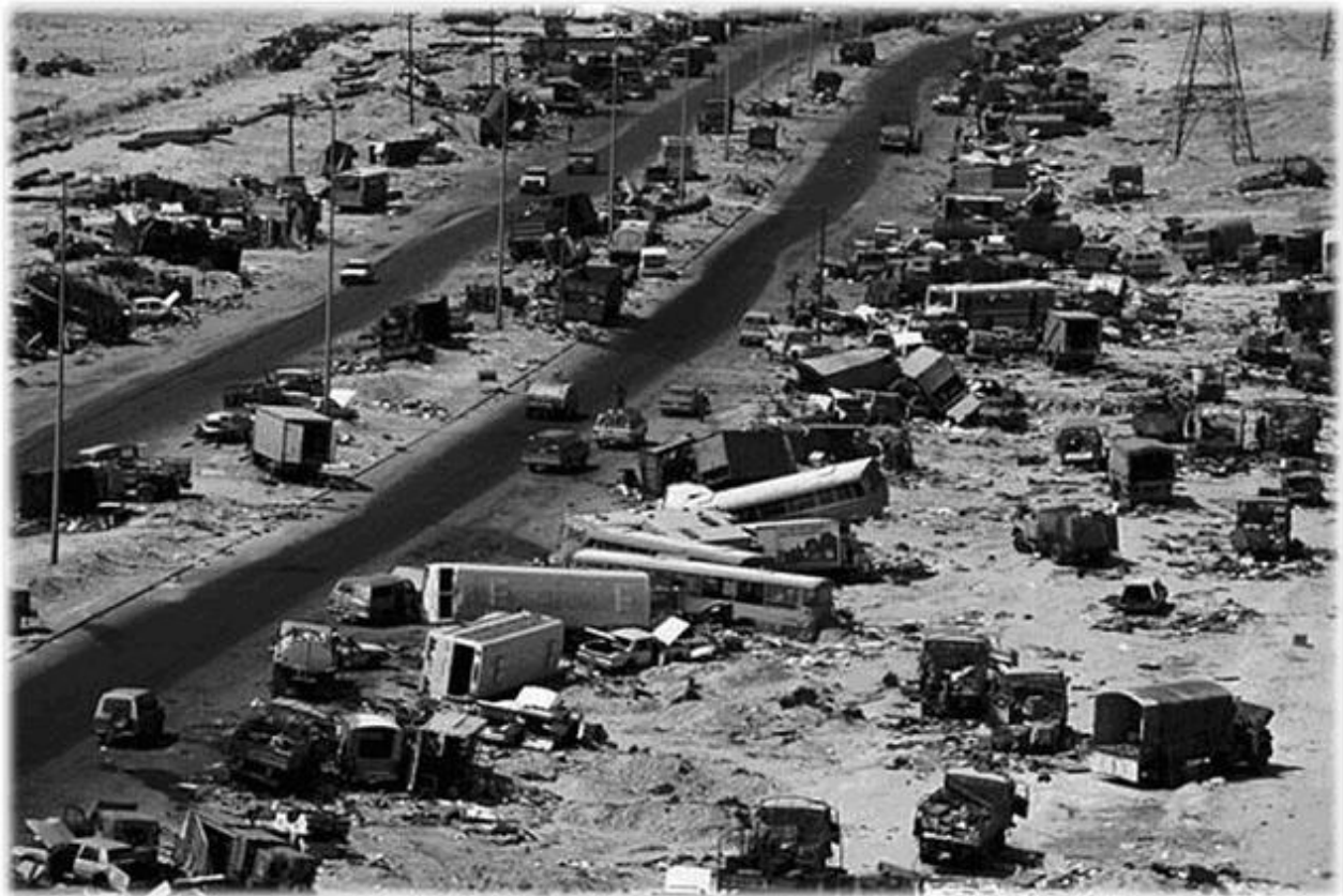
Figure 2: Iraqi army artilleries that have destroyed using DU on Highway

Figure 2 represents a photo of the Iraqi army artilleries and vehicles destroyed on that highway by (DU) weaponry [12].