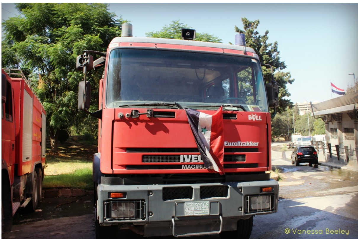
West Aleppo REAL Syria Civil Defence unit (Photo: Vanessa Beeley August 15, 2016)

A glance around their yard revealed that their equipment is tired and worn. The fire trucks were gleaming in the sun but showed signs of heavy use. Tattered jackets hung from the fenders and wing mirrors of the trucks and a Syrian flag had been draped across the radiator of one truck, perhaps in honour of our visit.