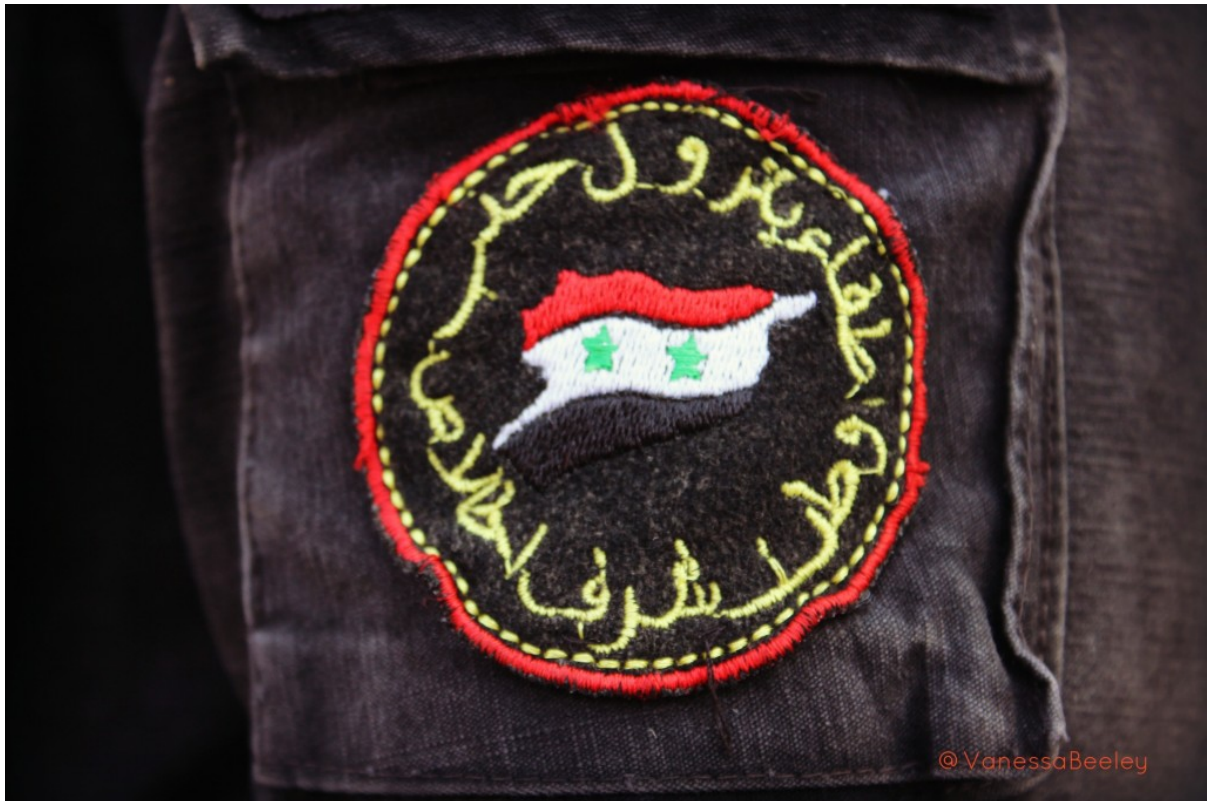
The badge of honour, the REAL Syria Civil Defence badge sewn on to the sleeves of the uniforms in West Aleppo

My final question to the REAL Syria Civil Defence in West Aleppo, was to ask them for their message to the outside world. The world that is unaware they even exist, many of whom are blinded by the propoganda glare that surrounds the White Helmet media circus. They responded thus: