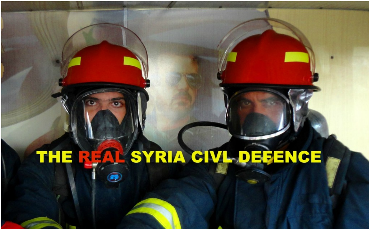
The REAL Syria Civil Defence, Lattakia, next stop on the tour of the true heroes inside Syria.