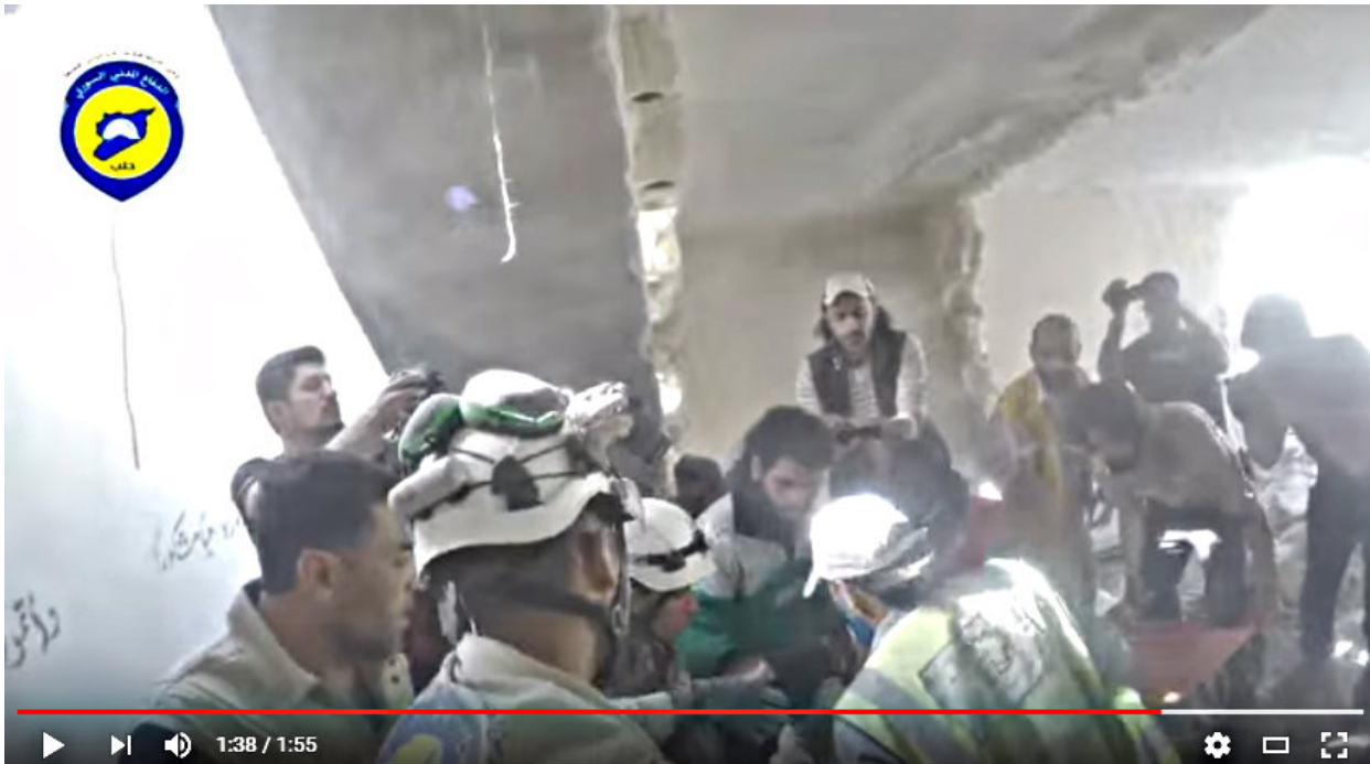
Screenshot from one of the multitude of NATO's White Helmets promotional videos, as per usual - with fans and camera crew in attendance.

So who, and what exactly are the White Helmets?