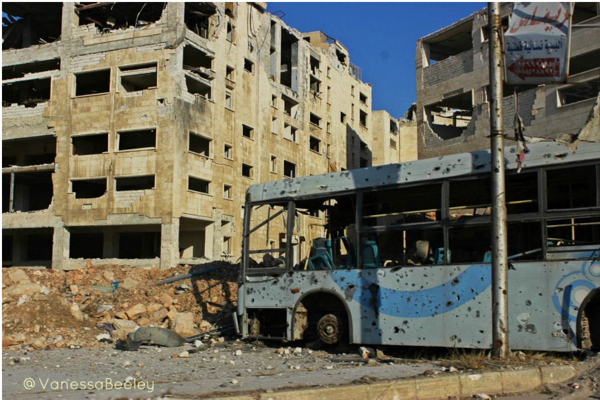
Decimated areas of Sheikh Maqsood, the northernmost, Kurdish held, entry point into the government held West Aleppo

For further information about the real situation in Aleppo, my journey to this terrorist besieged city and the debunking of the fictional US-NATO narrative, please read Part I of my article published at Mint Press: Journey to Aleppo: Exposing the Truth Buried under NATO Propaganda .