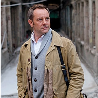
British Military officer James Le Mesurier

White Helmets 'Team' Photo: Screenshot from Netflix promotional documentary .