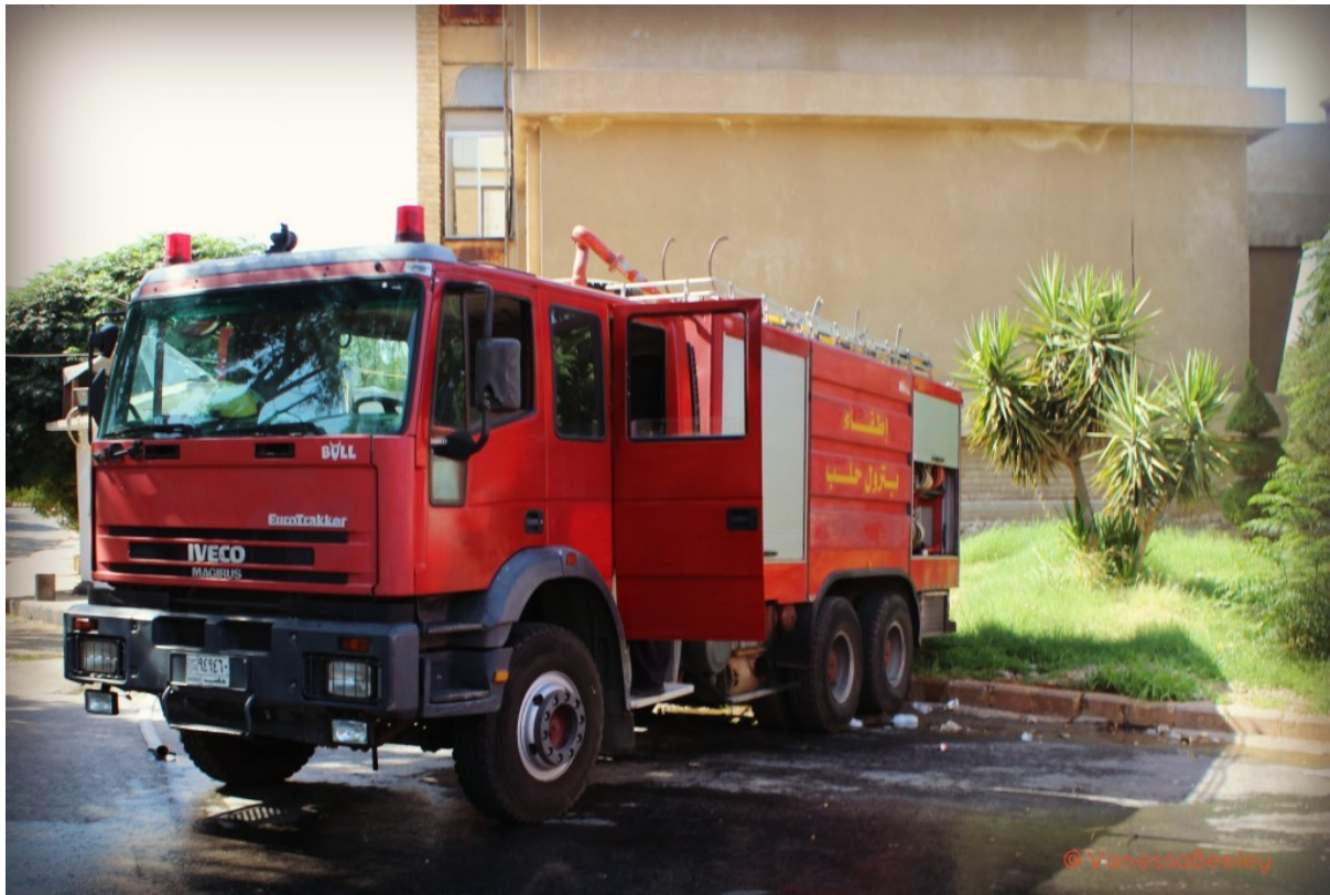
Aleppo REAL Syria Civil Defence Fire Engine parked in their yard

The West Aleppo crew is forced to attend missions without the standard issue equipment and to deal with situations like chemical weapons attacks with only the ineffectual paper breathing masks. This is another result of the EU-US sanctions being enforced against Syria, and effectively against the Syrian people. The REAL Syria Civil Defence is unable to replace equipment or replenish supplies, unlike the NATO White Helmets who enjoy an endless stream of kit and replacement materials via the Turkey supply chain that has remained unbroken for much of the four years that Aleppo has been under terrorist siege.