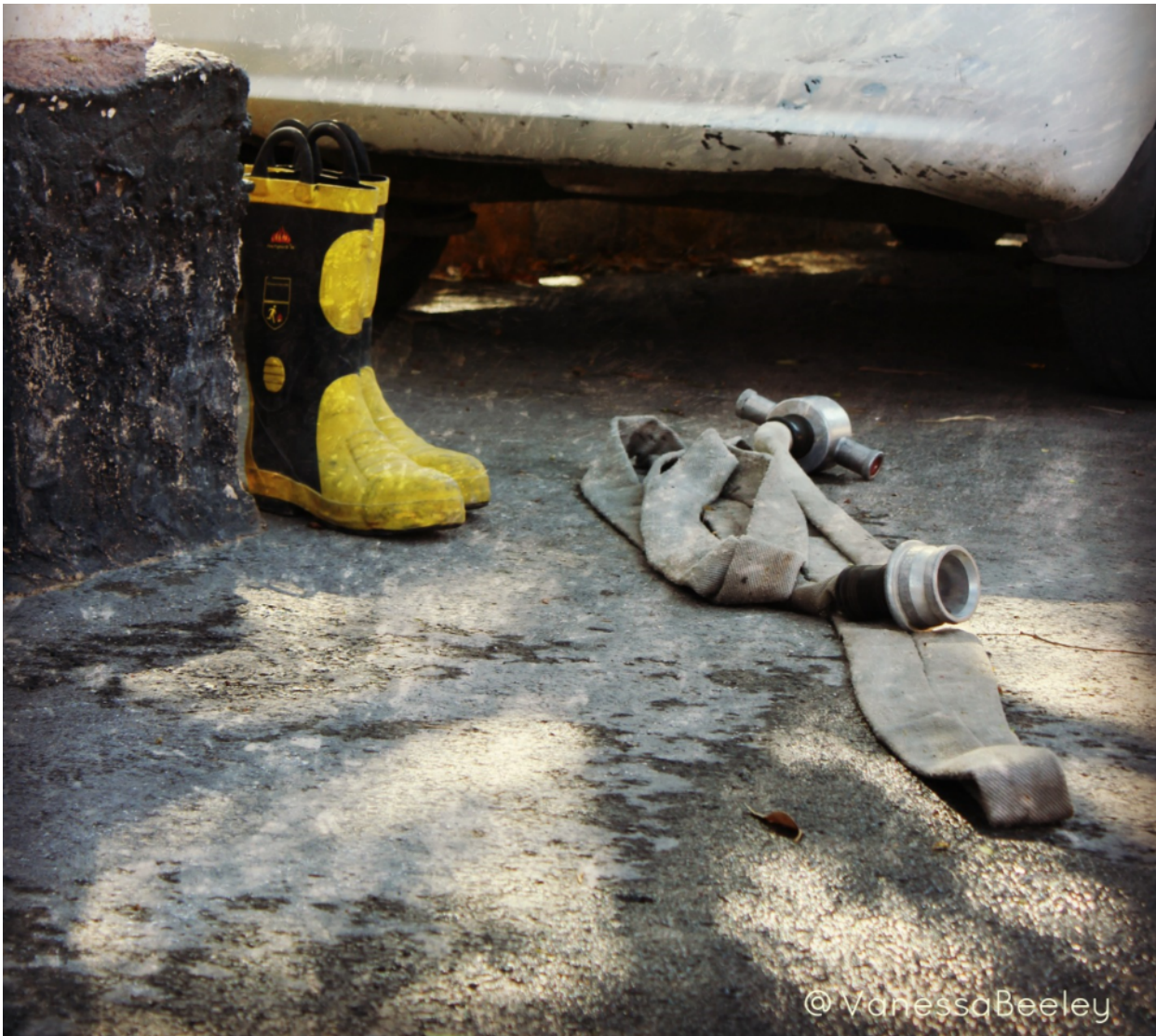
The staple equipment of fire crews and first responders. Visit to the West Aleppo REAL Syria Civil Defence