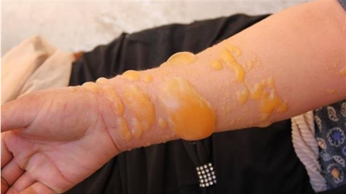
Painful skin blisters caused by an ISIS chemical weapon attack in Northern Aleppo 17/9/2016

The chemicals factory was taken over by Nusra Front and allies three years ago, they emptied everything out of it including potential ingredients for use in chemical weapon attacks. Part of the facility was shipped to Iraq. They destroyed the factory completely. ~ Voice from Aleppo