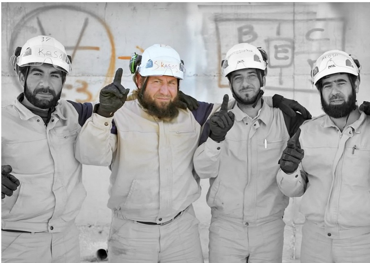
White Helmets 'Team'

Founded in 2013, the White Helmets, officially called the Syria Civil Defense, are often the only emergency first-responders available in rebel-held areas of Syria and claim to have saved more than 58,000 lives. ~ The Slate