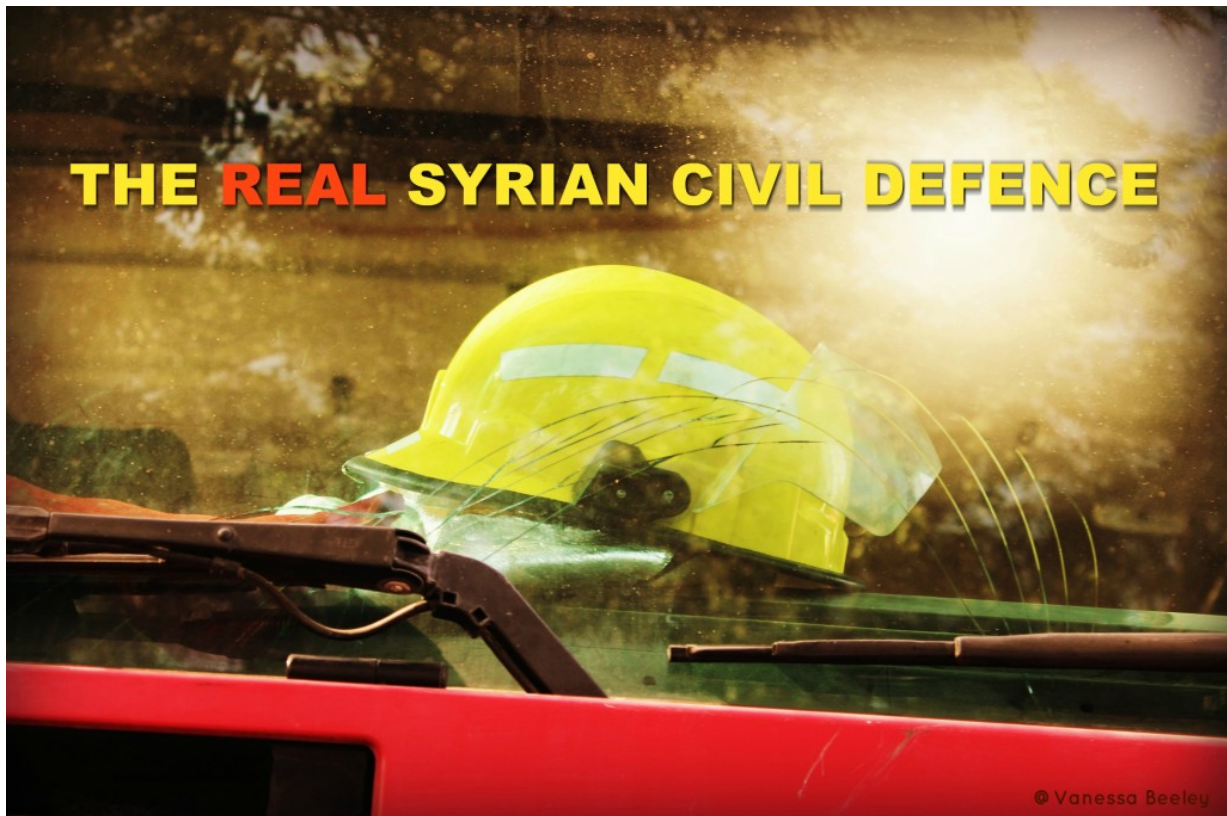
The REAL Syria Civil Defence, stationed in Syrian government held West Aleppo