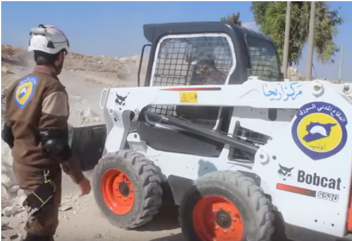
US EQUIPPED: White Helmets showing off their brand new equipment in Idlib (on borders with Turkey) supplied by US Equipment company, Bobcat