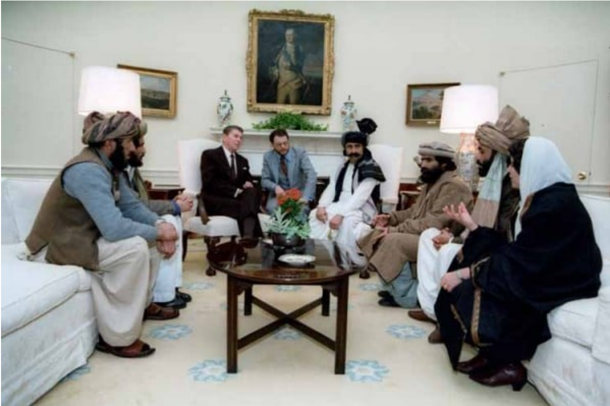
President Reagan and Mujahideen leaders from Afghanistan

Many people defend America's decision to arm the mujahideen in Afghanistan because they believe it was necessary to defend the country and the wider region from Soviet aggression. However, Brzezinski's own statements directly contradict this rationale. In a 1998 interview, Brzezinski admitted that in conducting this operation, the Carter administration had "knowingly increased the probability" that the Soviets would intervene militarily (suggesting they began arming the Islamist factions before the Soviets invaded, making the rationale redundant since there was no invasion Afghanistan freedom fighters needed to repel at the time). Brzezinski then stated: