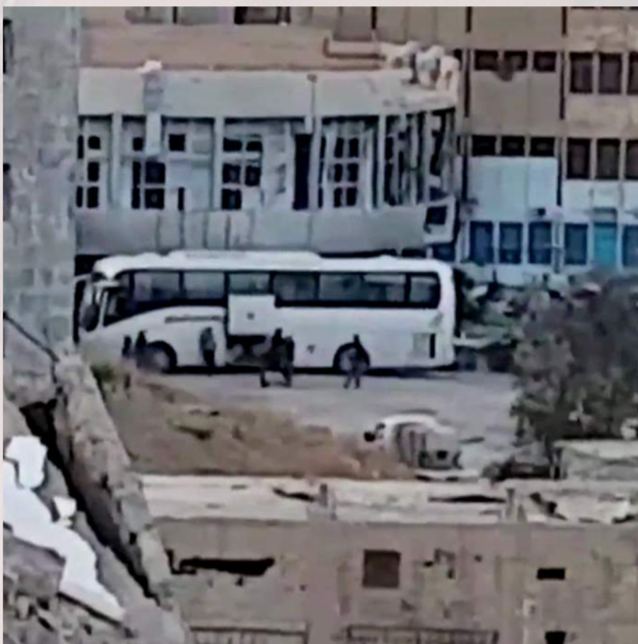
IS family members prepare to leave

“Some were talking in French, others in English, others in some foreign language,” he says. (Ibid)