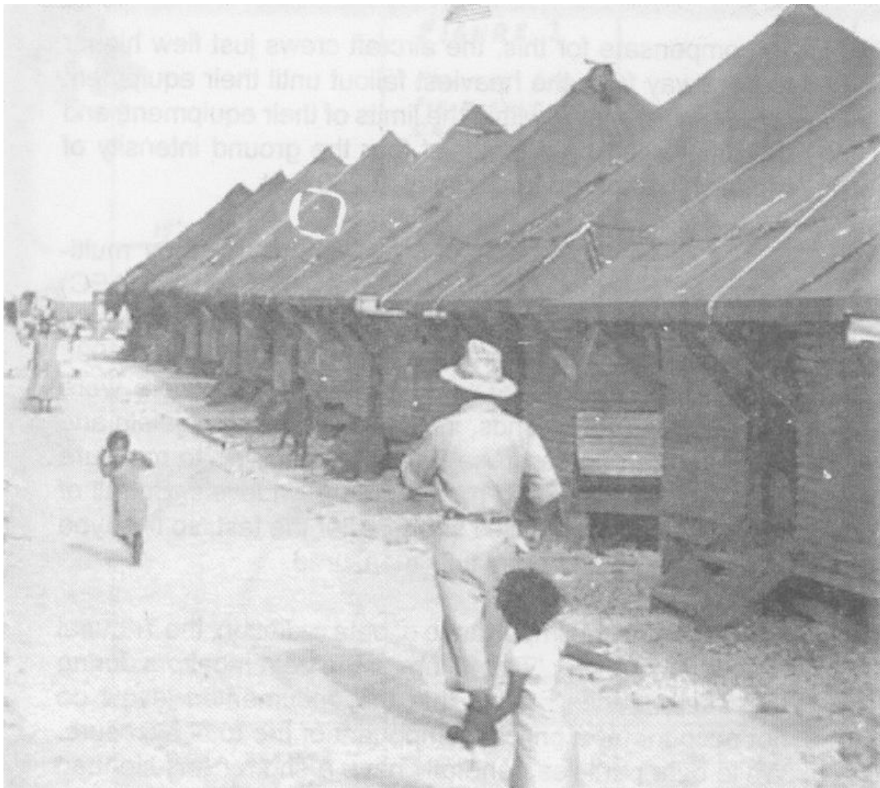
“Temporary housing” for those evacuated from Bikini Atoll (above) and Fukushima (below) Agricultural test plot on contaminated land near the Polygon (test site) in Kazakhstan

area. In almost all cases the public housing provided to officially recognized victims proves not to be temporary, but becomes permanent.