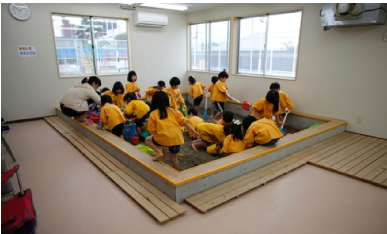
Fukushima school children play in an indoor sandbox

In Fukushima Prefecture the Japanese government proclaimed a 20km mandatory evacuation zone, while also designating a “suggested” evacuation zone from 20km to 30km. These zones do not directly reflect the dangers from radiation levels. In some of the mandatory evacuation areas the gamma levels are below those in parts of the suggested evacuation areas. Some areas where the plumes came down 50-80km away have even higher levels. The limits to mandatory evacuation areas reflect efforts to limit the direct liability of the government. Even today children live in areas where the radiation levels are too high for them to be allowed to play or spend significant time outdoors.