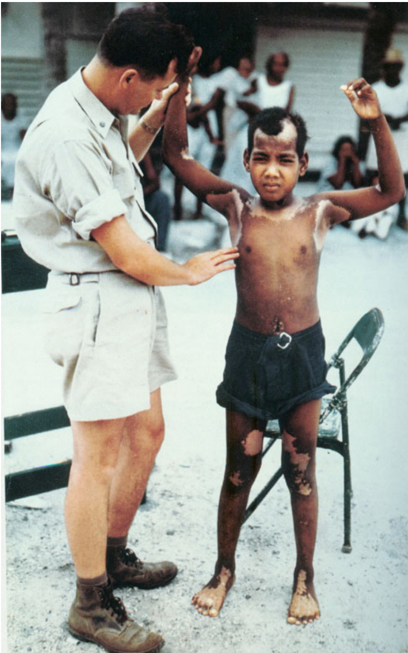
US doctor examines a young Rongelapese affected by Bravo radiation