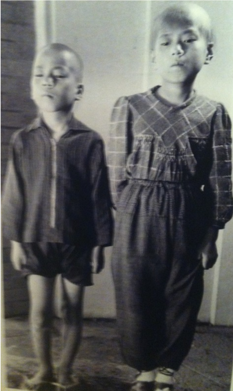
Young hibakusha in Hiroshima suffering from radiation sickness photographed at the ABCC

In 1966 a US nuclear bomber blew up in midair and the debris fell on the small village of Palomares, Spain. Four H-bombs fell from the plane, one into the sea, and three onto the small village. None exploded but two broke open and contaminated part of the town with plutonium and other radionuclides. To this day some of the residents of Palomares are taken to Madrid each year for a medical examination as the effects of exposure on their health is tracked. They have never been given any of the results of the tests nor informed if any illnesses they develop were related to their exposures. They are subjects, not participants in the gathering and assessing of the effects of radiation on their bodies. There is no doubt that such studies contribute data to scientific understanding of the health consequences of radiation exposures (the data itself is contentious for reasons cited below) 8 , however for those from whom the information is gathered, being studied but not informed reduces one's sense of integrity and agency in one's health maintenance. Many Pacific islanders exposed to radiation by the nuclear tests of the US, the UK and France had such experiences where they were examined and then sent off with no access to the results and no medical follow-up. Many report feeling as if the data had been harvested from them and at their expense.