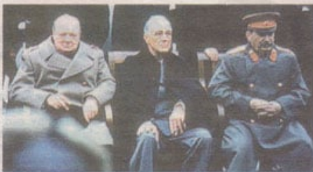
BIG THREE Winston Churchill, Franklin D Roosevelt and Stalin

The accompanying notes propose: "The area known as Eire and Northern Ireland shall be unified as a demilitarised republic of Eire."