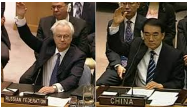
Russia and China attempt to prohibit space weapons at the United Nations.

President Obama has in the past called for the abolition of nuclear weapons. The Russians, watching an advancing NATO and MD deployments near their borders, are telling the world that any real hopes for serious nuclear weapons reductions are in jeopardy.