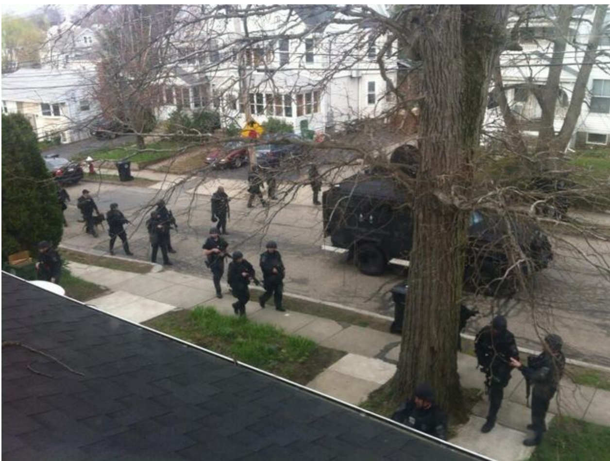
Image: Military forces ding house-to-house searches during the Boston lockdown in April, 2013

As Vladimir Lenin explained in his epochal work, The State and Revolution , beginning from the late 19th century, the development of the capitalist state in general has been characterized by the “perfecting and strengthening of the ‘executive power,’ its bureaucratic and military apparatus.”