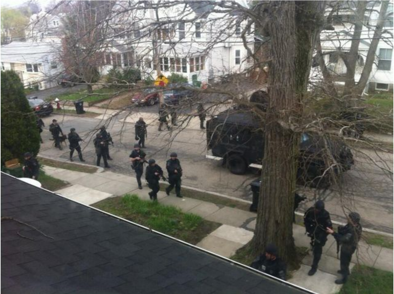
Military forces doing house-to-house searches during the Boston lockdown in April, 2013

As Vladimir Lenin explained in his epochal work, The State and Revolution , beginning from the late 19th century, the development of the capitalist state in general has been characterized by the “perfecting and strengthening of the ‘executive power,’ its bureaucratic and military apparatus.”