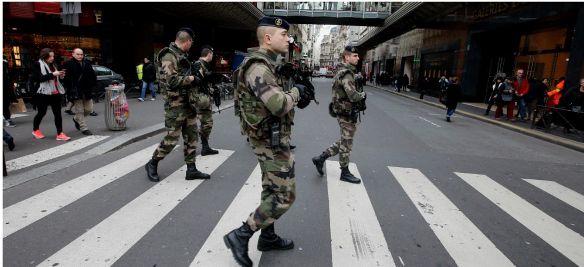
Des militaires français marchent dans les rues de Paris dans le cadre du plan Vigipirate, en janvier 2015.

Robin Panfili | France | 02.10.2015 - 10 h 45 | mis à jour le 02.10.2015 à 12 h 45