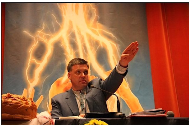
Image on the right: McCain met with Social-National Party co-founder Oleh Tyanhbok.

"Ukraine will make Europe better and Europe will make Ukraine better!" McCain proclaimed to cheering throngs while Tyanhbok stood by his side. The only issue that mattered to him at the time was the refusal of Ukraine's elected president to sign a European Union austerity plan, opting instead for an economic deal with Moscow.