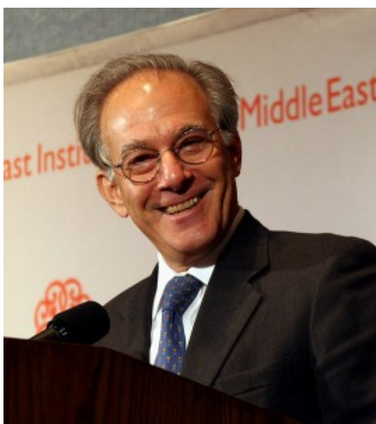
Washington Post columnist David Ignatius.

Typical of these recent mainstream tirades about this vague Russian menace, Ignatius's column doesn't provide any specifics regarding how RT and other Russian media outlets are carrying out this assault on the purity of Western information. It's enough to just toss around pejorative phrases supporting an Orwellian solution, which is to stamp out or marginalize alternative and independent journalism, not just Russian.