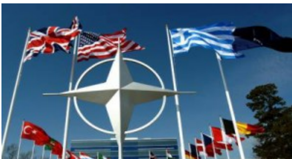
NATO headquarters in Brussels, Belgium.

Last year, as the New Cold War heated up, NATO created the Strategic Communications Command in Latvia to further wage information warfare against Russia and individuals who were contesting the West’s narratives.