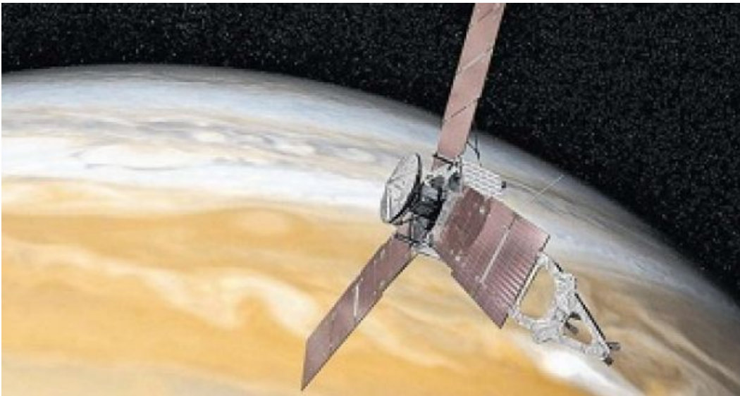
Juno spacecraft above the north pole of Jupiter

But NASA has insisted that it needs nuclear power for missions into space—claiming for years that it could not use anything but atomic energy beyond the orbit of Mars. However, that has been proven incorrect by NASA itself. On July 4 th , Independence Day, 2016, NASA’s solar-energized space probe Juno arrived at Jupiter. Launched from Cape Canaveral on August 5, 2011, it flew nearly two billion miles to reach Jupiter, and although sunlight at Jupiter is just four percent of what it is on Earth, Juno’s solar panels were able to harvest energy.