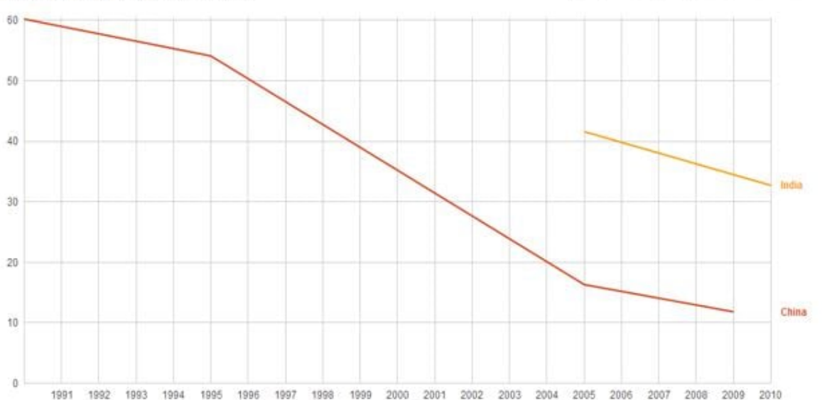
Population living below $1.25 PPP per day ?

The mistake which people generally make is when they start comparing India with Pakistan or Bangladesh, this is incorrect for many reasons, India is an enormous big country, its market share, volume is big, its population is big it should be compared more with China. China went in more difficult level in combating poverty than India, but being a communist, it has reduced poverty effectively. It's also true that in China the gap between Rich and Poor is widening but better to have that gap rather than letting your people live in poverty.