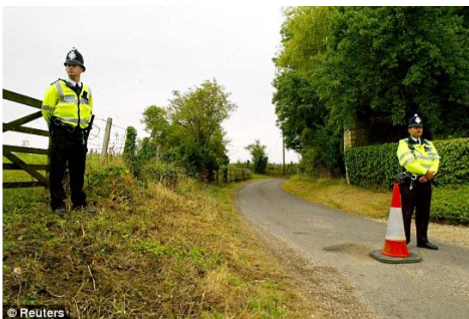
British police officers guard a road leading to Harrowdown Hill near the home of Dr Kelly in Oxfordshire

Liberal Democrat MP Norman Baker, who in 2007 wrote a book suggesting that Dr Kelly was murdered, used the Freedom of Information Act in January to apply to the Ministry of Justice to see the records.