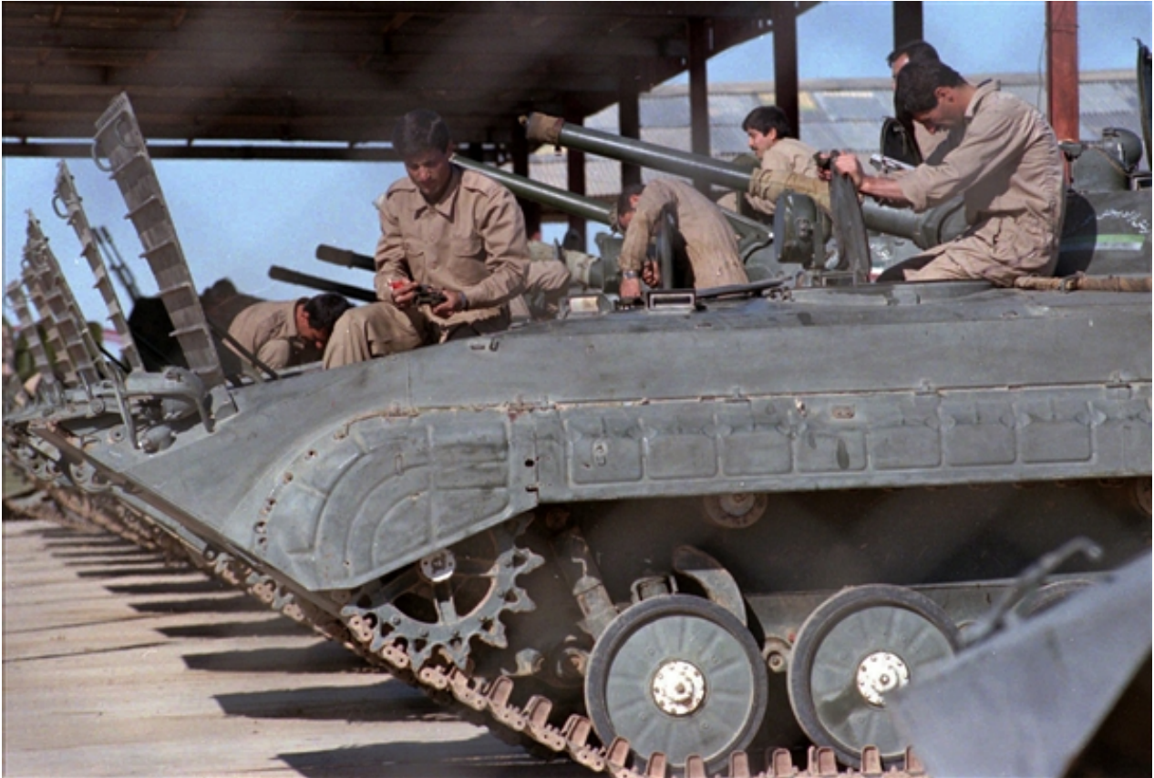
Image: MEK terrorists in Iraq, 1997. Saddam Hussein used MEK terrorists to wage proxy war on Iran. Ironically despite accusing Hussein of state-sponsored terrorism for just such a policy, the US eagerly inherited the terrorist organization and has since then aspired to use MEK in a similar fashion.