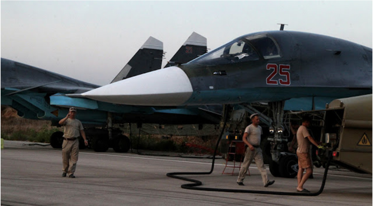
Image: Russia is not in Syria to merely “prop up” the Syrian government – it is in Syria to stop a global blitzkrieg that has consumed several nations before Syria, and will consume all nations after Syria, including Russia itself.

Even as the US adamantly denies the obvious – that is has intentionally created and is currently perpetuating Al Qaeda, the so-called “Islamic State,” and other terrorist groups in Syria, it is openly conspiring to use another army of terrorists against neighboring Iran, live before a US Senate hearing. Should the US succeed in Syria, it would not be the end of the conflict, but only the end of the beginning of a much wider world war.