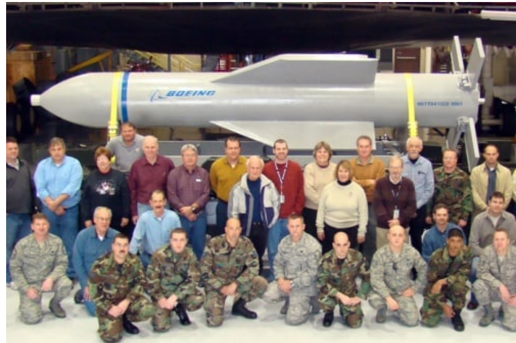
GBU-57A/B Mass Ordnance Penetrator (MOP)