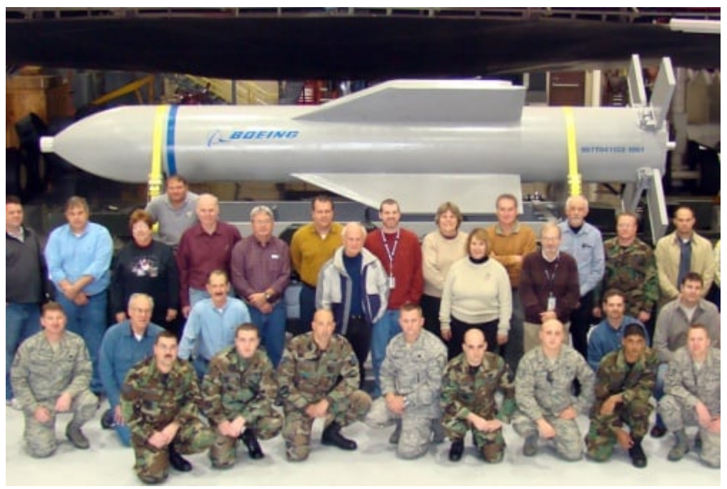
GBU-57A/B Mass Ordnance Penetrator (MOP)