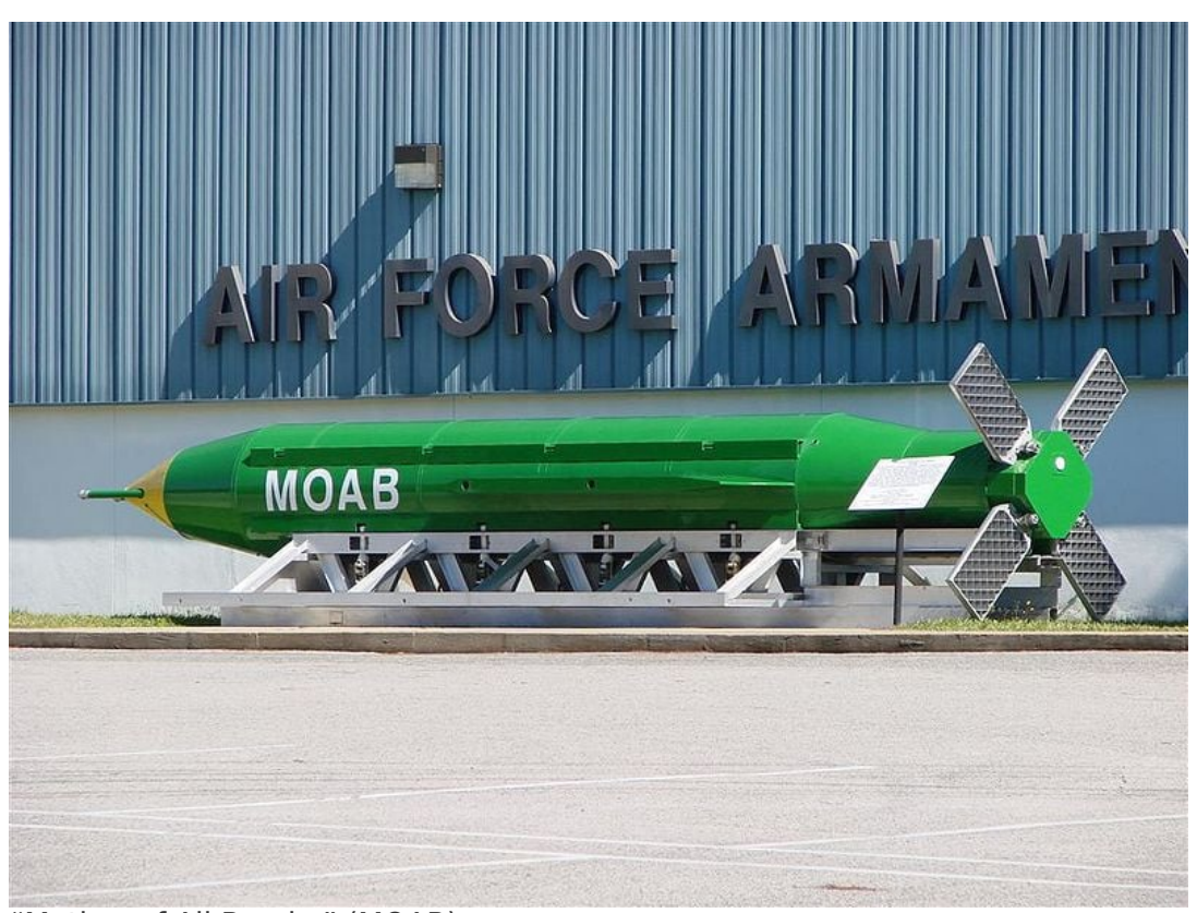
"Mother of All Bombs" (MOAB)

These are WMDs in the true sense of the word. The not so hidden objective of the MOAB and MOP, including the American nickname used to casually describe the MOAB ("mother of all bombs'), is "mass destruction" and mass civilian casualties with a view to instilling fear and despair. See <a href="Towards a World War III Scenario?">Towards a World War III Scenario?</a> The Role of Israel in Triggering an Attack on Iran, Part II <a href="The Military Road Map">The Military Road Map</a>, Global Research, August 13, 2010