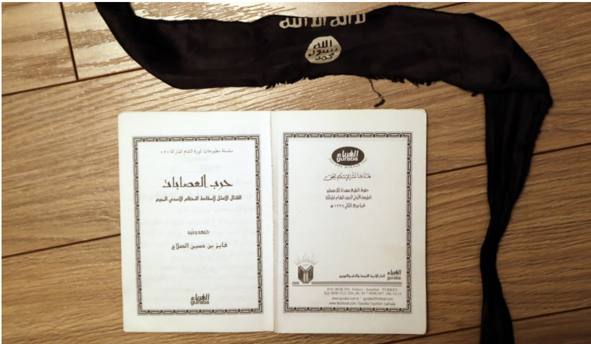
A suicide bomber's head-band and a manual, entitled "How to wage an ideal fight against the criminal Assad regime" found in an office of one of the Daesh jihadists in Shadadi.

The manual was found in one of the hospitals of Shadadi, which Daesh fighters kept holding even after the rest of the town was liberated.