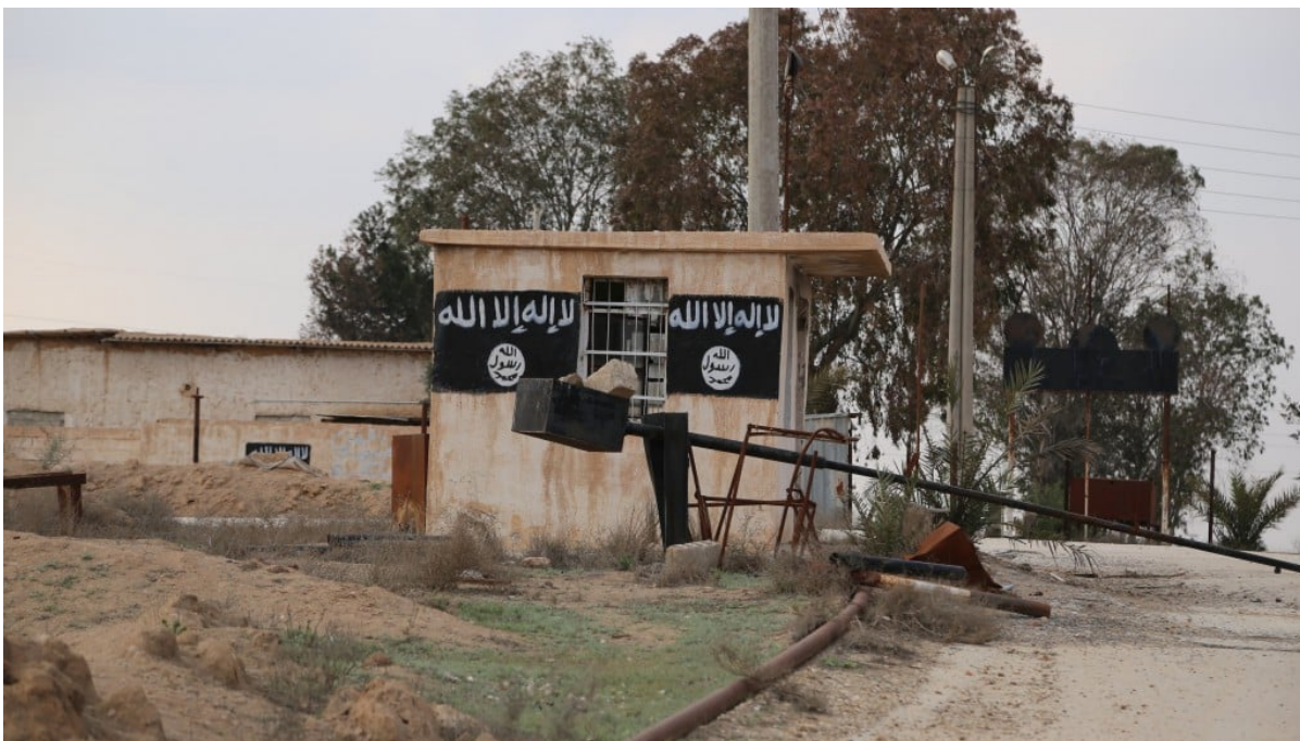
One of the buildings used earlier by Daesh

All the towns are located in an oil-rich area and were populated predominantly by the Syrian Kurds.