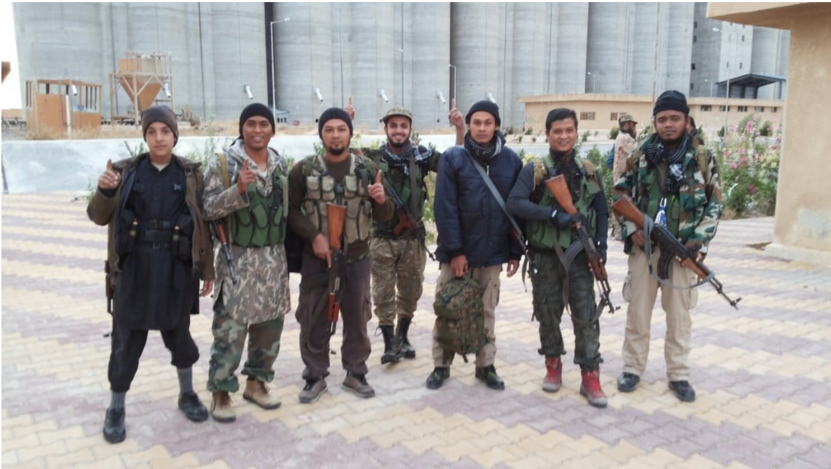
A picture of Daesh fighters taken from one of the captives.

The journalists interviewed the YPG fighters who liberated the area. Shadadi was freed in February 2016 and was the last town the Daesh group controlled in Syria's northeastern Hasakah province. The capture of the city closed off a key supply route for Daesh between Iraqi Mosul and Syrian Raqqa.