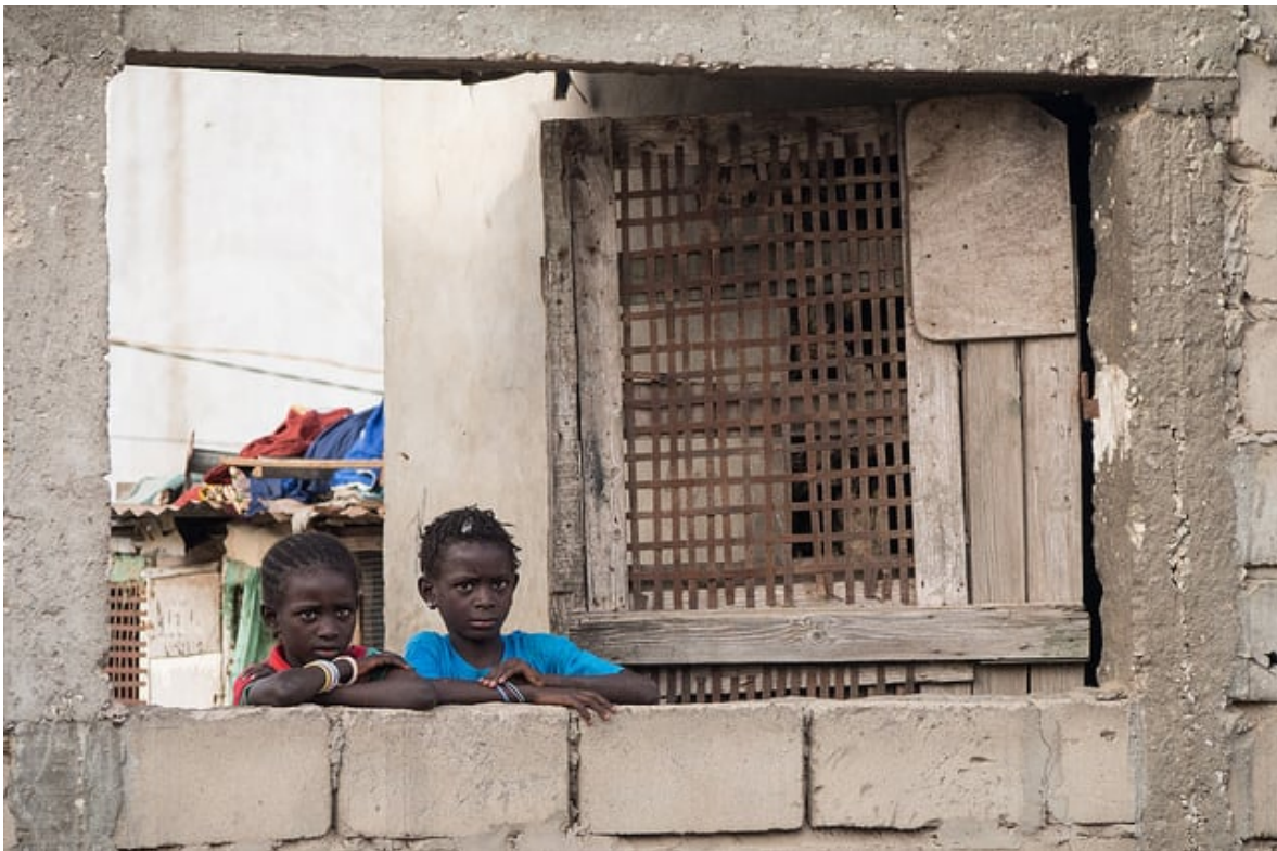
The manual was apparently issued and printed in Istanbul, Turkey, as it has the Turkish address, phone numbers and Facebook page in the lower right-hand corner.

Along with the manual, a suicide bomber's head-band was found in an office of one of the Daesh jihadists in Shadadi.