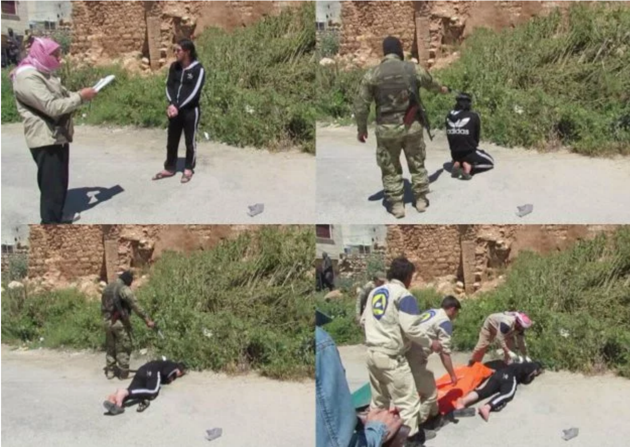
Picture shows White Helmets 'cleaning up' after Al Nusra execution in Aleppo dated 5/5/2015.

the mainstream Western media as heroes selflessly fighting for human rights in Syria. The White Helmets are mostly funded by Western nations including the US and many EU and NATO countries, and are hence far from impartial. They have been taken in fabricating footages of their heroic rescue missions more than once and have been widely criticized by local Syrians as being nothing more than terrorists disguised as freedom fighters (Source pt1 pt2 ).