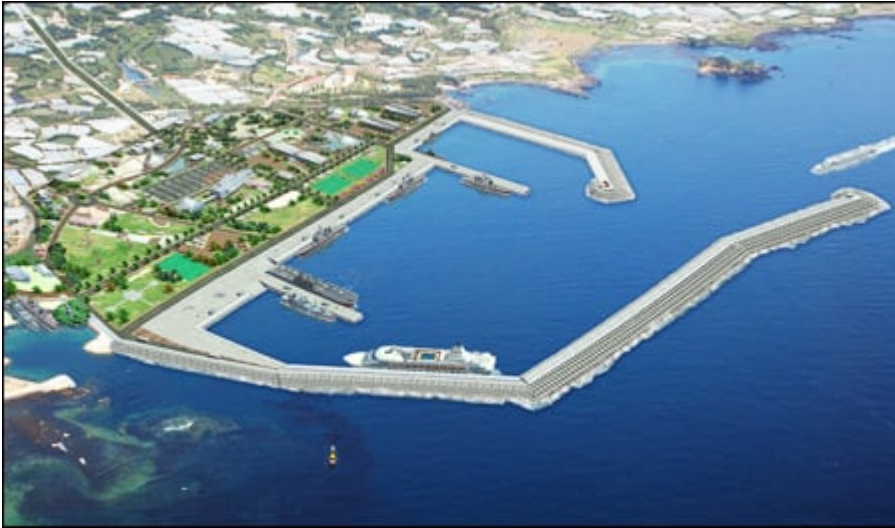
Jeju Existing Naval Base

However, Jeju Island is not only a precious natural treasure in Korea, it is also a UNESCO-designated World Heritage Site, which is slated to be transformed into a US island military base.