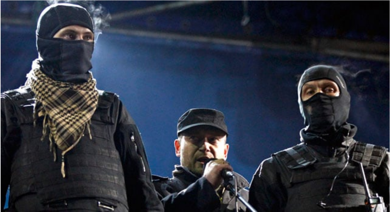
Dmitry Yaroch (centre), leader of Right Sector

Although many in the media dismiss the Right Sector (Pravy Sektor) as insignificant, this body was formed in 2013 as an umbrella organization that included several paramilitary groups, including the Ukrainian National Assembly-Ukrainian National Self Defense (UNA-UNSO) whose members dress in uniforms modelled on Hitler's Waffen SS and have been fighting Russia for years, including in Chechnya.