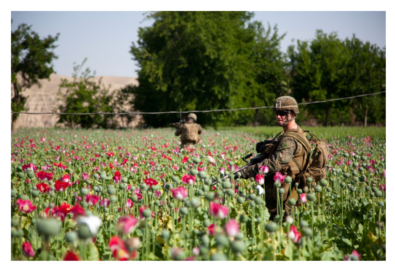
SOURCE: Washington's Blog, Are American Troops Protecting Afghan Opium? U.S. Troops Patrolling Poppy Fields In Afghanistan (Photos) Global Research, October 28, 2012

The HSBV is no exception. Today, corporate capital continues to protect the drug trade and the most respected banking institutions annually launder billions of narco-dollars. It is worth noting that since 2001, Afghanistan's war shattered economy supplies more than 90 percent of the World's heroin. The highly lucrative drug trade out of Afghanistan is protected by the US-NATO occupation forces on behalf of powerful financial interests: a multibillion dollar bonanza for the banks and the criminal syndicates involved in the Golden Crescent drug trade. The resulting flow of narco-dollars is largely laundered in the Western banking system.