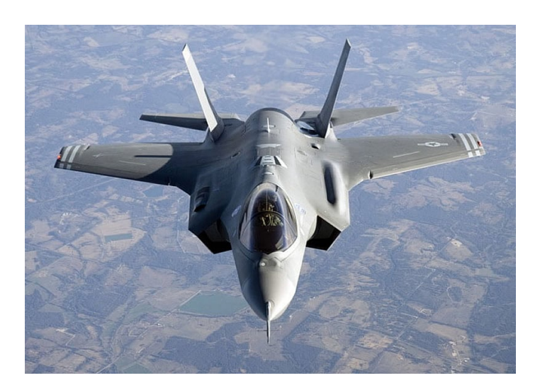
of F-35 fighter at $1.51 trillion., Chicago Tribune, April 2, 2012).