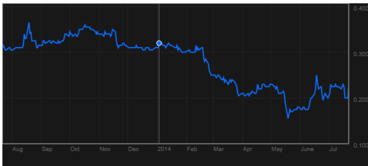
Table 4 Malaysian Airlines MAS Stock Values (July 2013- July 2014)

The annual decline in MAS stock is of the order of 25.8 (see chart below)