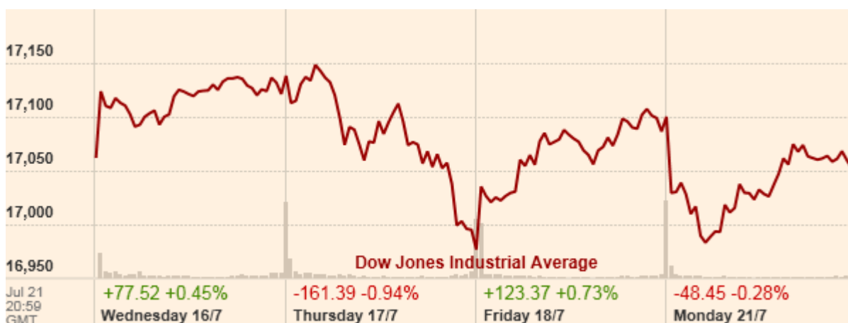
Table 1 Down Jones Industrial Average (DJIA)

In the wake of the July 17 crash of MH17, the Dow Jones Industrial Average (DJIA) declined from its 17150 peak and subsequently bounced back (see chart below). Foreknowledge of the MH17 would have allowed the reaping of financial gains on the short term movement of the Dow from one day to the next.