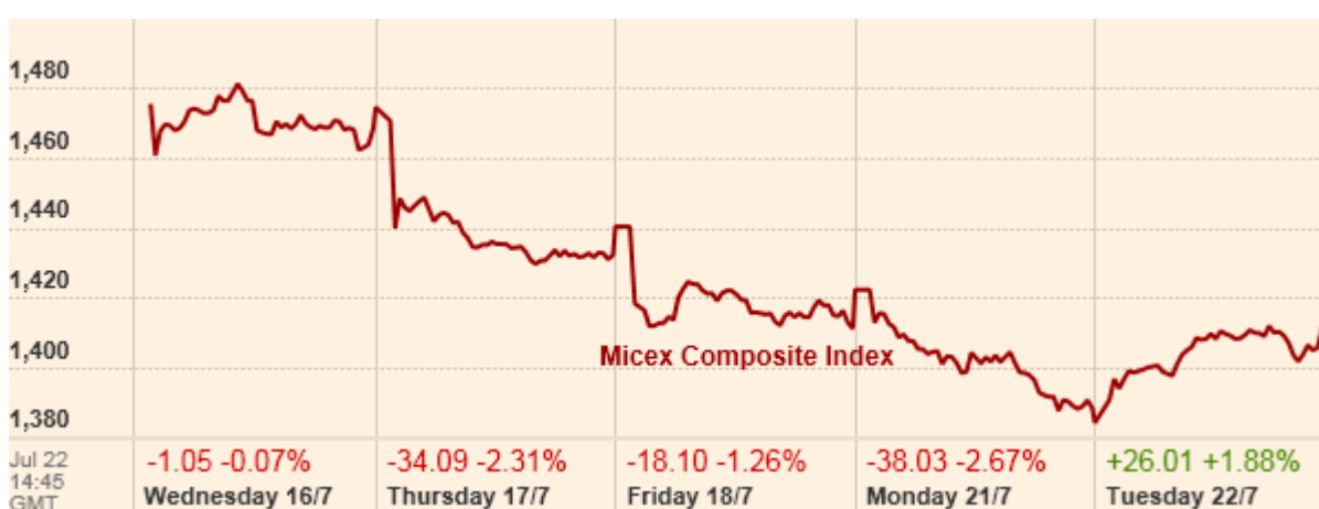
Table 2 Moscow Stock Exchange MICEX Composite Index

Those who had advanced knowledge of the MH17 crash and the likely accusations directed against Russia by president Obama would no doubt have placed their bets on a decline of both the MICEX and the Russian ruble.