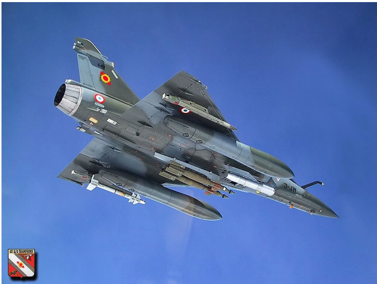
France's Mirage 2000 used in Operation Odyssey Dawn against Libya,

Multiply the number of strike sorties (7768 since March 31) by the average number of missiles or bombs launched by each of the planes and you get a rough idea of the size and magnitude of this military operation. A French Dassault Mirage 2000, for instance, can transport 18 missiles under its wings. America's B-2 Stealth bombers are equipped with bunker buster bombs