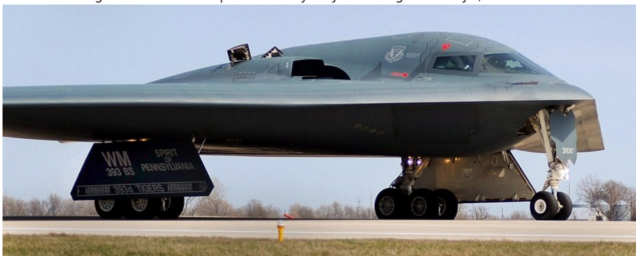
USAF Stealth B-2 Bomber used in Operation Odyssey Dawn

Pursuant to NATO's humanitarian mandate, we are informed by the media that these tens of thousands of strikes have not resulted in civilian casualties (with the exception of occasional "collateral damage").