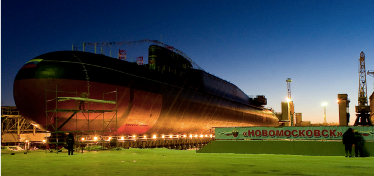
K-407 "Novomoskovsk" submarine

DV: The Kursk tragedy was the biggest blow to the Russian Navy?