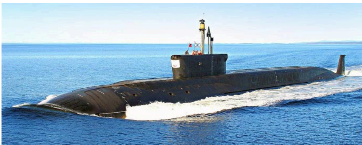
"Borei" class submarine

IKK: I have no information about what they are doing. Our surprise check of the Pacific Fleet, which is now being carried out by our submarines and ships, is an opportunity to show the Americans what we mean. It is certain that they would not perform the exercise if we had nothing to show them.