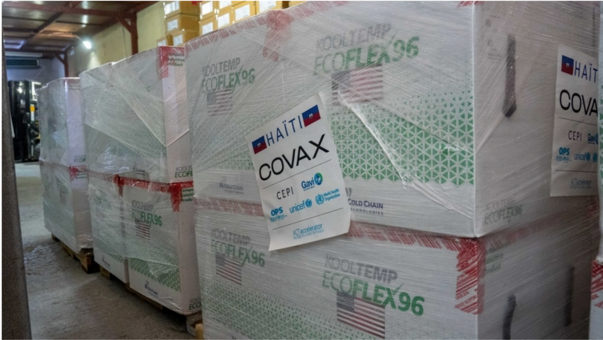
A half-million doses of vaccines donated by the U.S. government through COVAX landed in Port-au-Prince, the capital of Haiti, July 14, 2021.

This first shipment to Haiti was part of a US Aid program consisting of 500 million doses of the “killer vaccine” which is slated to be sent to a large number of developing countries (For further details see below).