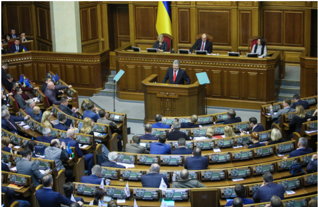
📷 Ukraine's President Petro Poroshenko speaks during an emergency session regarding declaration of martial law in Ukraine on Nov. 26, 2018.