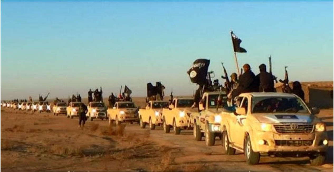
Image: If the US and its allies are arming, funding, and training “moderate rebels” to the tune of billions of dollars, who is arming, funding, and training ISIS on a greater scale that has allowed them to dominate the fighting in Syria and Iraq? The answer of course is there were never any moderates to begin with, and the rise of ISIS was very much intentional.

.And finally, we are expected to believe not only all of this, and that ISIS is independently supporting expanding operations in Afghanistan and Libya, but that ISIS now has the extra time, money, resources, and inclination to attack Indonesia all the way in Southeast Asia. Few nations-states on Earth possess the ability to do what it is claimed ISIS is doing, everywhere it is doing it, and to the degree of success it is allegedly doing it with. Among those few nations, there is only one that benefits from ISIS’ activities. The United States. What’s the US Using ISIS and other Terror Groups in Asia for and Why?