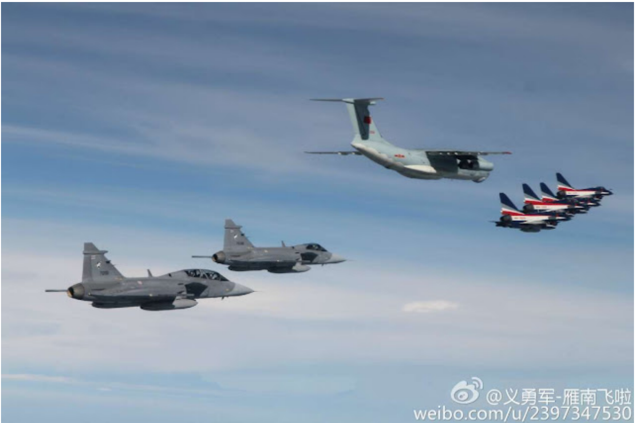
Image: Thailand and China conducted their first ever joint-air military exercises last year, amid ongoing efforts by Thailand to modernize its military through the purchase of Chinese weapon systems including armored vehicles and even submarines. .

Killing Chinese tourists in Thailand was aimed at straining recent and growing ties between Bangkok and Beijing . Thailand has recently sought closer military and economic cooperation with China while slowly moving away from an increasingly meddlesome West. Bangkok had sought to purchase Chinese weapons, including several submarines. It already possesses Chinese-made warships and armored vehicles, and late last year conducted its first ever joint Thai-Chinese air military exercises. Economically, Thailand has been working with China toward a deal to construct additional rail infrastructure both in Thailand, and connecting the nation beyond, including to China itself. When the US has repeatedly placed pressure on Bangkok to join its provocations in the South China Sea aimed at Beijing, Bangkok has repeatedly insisted that the conflict is none of their business, and that they will play no part in it.