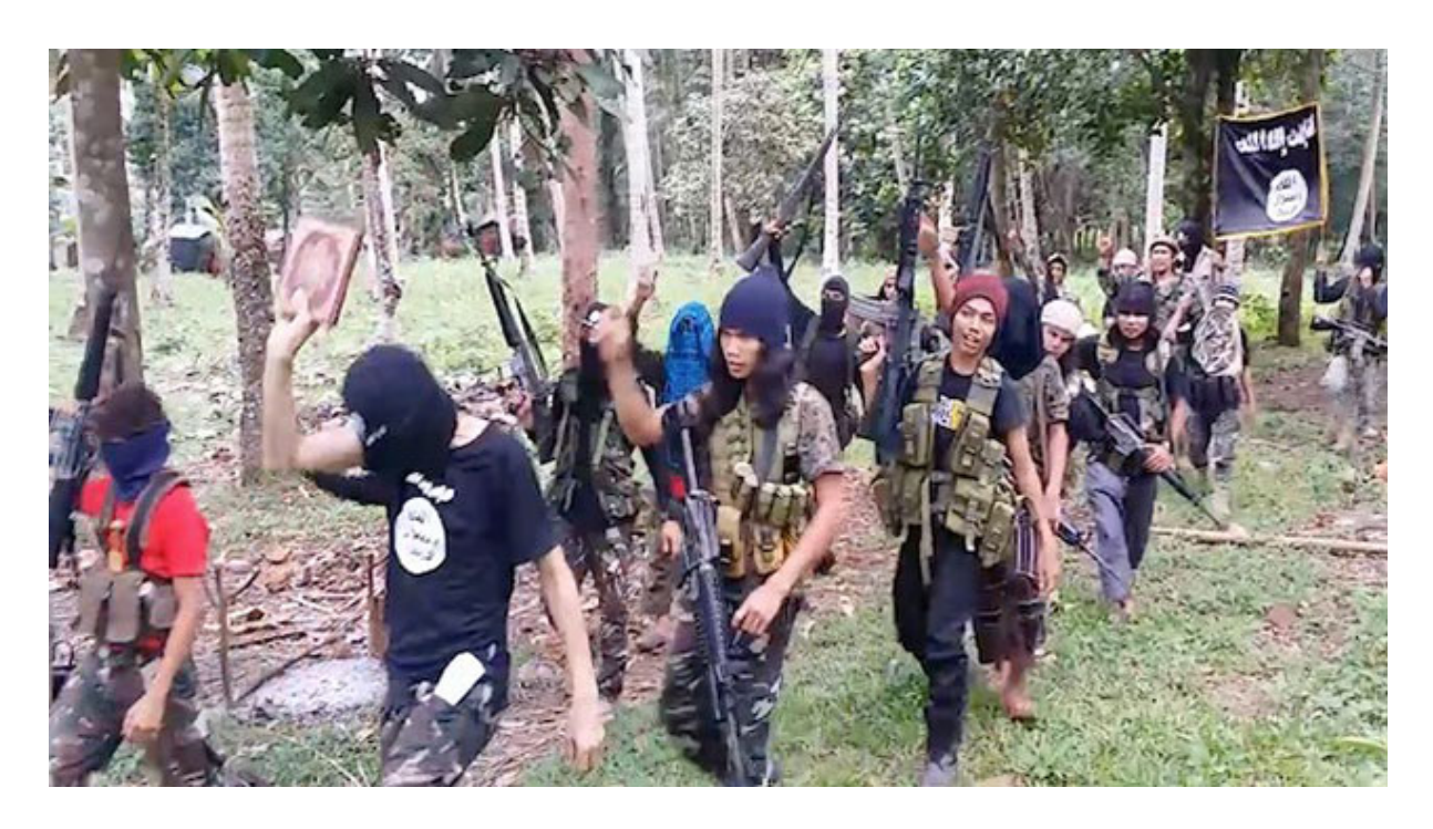
'FILIPINO TERROR? - The Filipino group seen above, is said to have recently pledged to ISIS.

Remaining in Syria though, let's not forget Obama and NATO's desire to help the Libyans during their deeply troubling humanitarian crisis back in 2011. In fact, as a result of the Western-backed NATO campaign in 2011 used to oust Gaddafi – the instability has only grown.