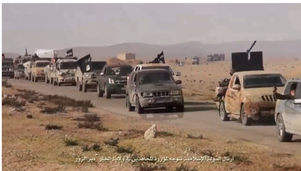
ISIS convoy leaves Raqqa, Syria

ISIS is also being used as a “place-setter” in Syria. Similar military strategies have been deployed in the occupation and destruction of Raqqa, Syria.