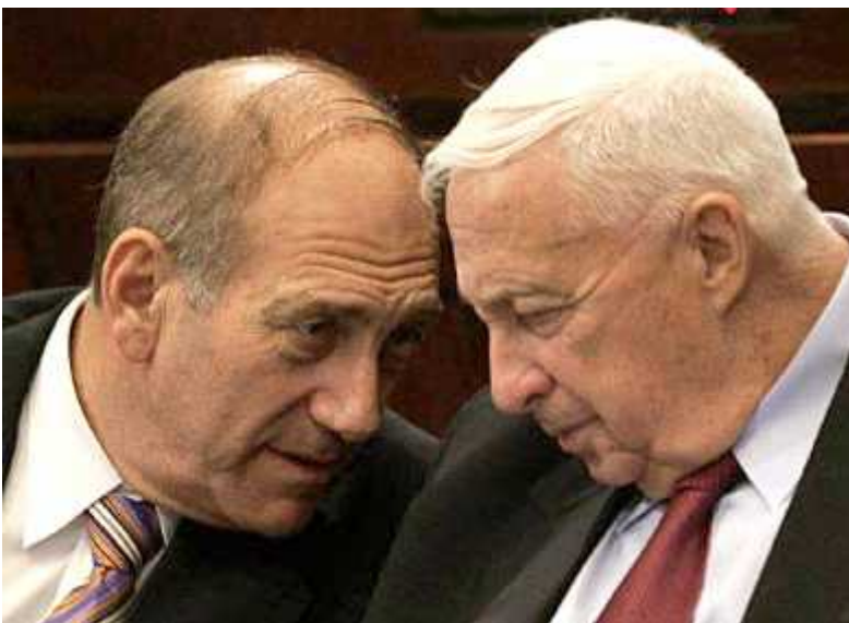
Olmert and Sharon

It is important to focus on a number of key events which have led up to the killings in Gaza under “Operation Cast Lead”: