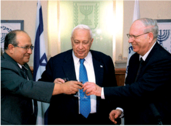
From Left to Right: Dagan, Sharon, Halevy

The Dagan Plan has established continuity in the military-intelligence agenda. In the wake of the 2000 elections, Meir Dagan was assigned a key role. “He became Sharon’s “go-between” in security issues with President’s Bush’s special envoys Zinni and Mitchell.” He was subsequently appointed Director of the Mossad by Prime Minister Ariel Sharon in August 2002. In the post-Sharon period, he remained head of Mossad. He was reconfirmed in his position as Director of Israeli Intelligence by Prime Minister Ehud Olmert in June 2008.