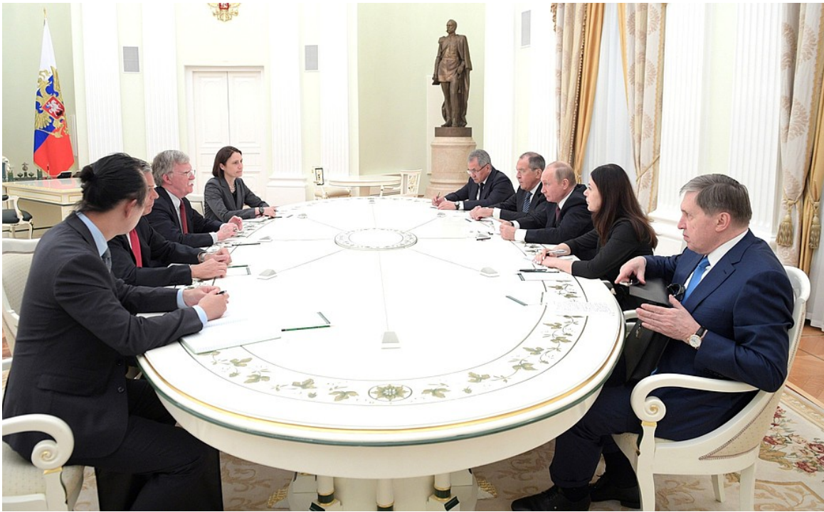
John Bolton meeting Vladimir Putin in Moscow

Lastly, before turning to the strategic dimension, the Russian officials underlined that, if the INF collapses, Russia would not be the first to deploy to the European theater (or in any other theater) any missiles banned by that treaty.