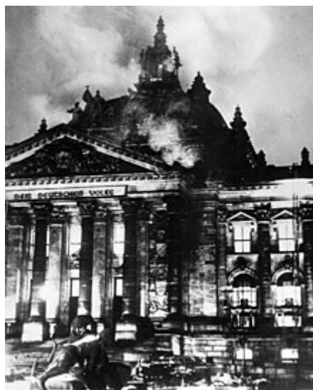
The Reichstag Fire, Berlin, February 1933

The following year, upon the death of president Hindenburg in 1934, Hitler “declared the office of President vacant” and took over as Fuerer , the combined function’s of Chancellor and Head of State.