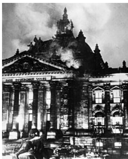
The Reichstag Fire, Berlin, February 1933

The following year, upon the death of president Hindenburg in 1934, Hitler “declared the office of President vacant” and took over as Fuerer , the combined function’s of Chancellor and Head of State.