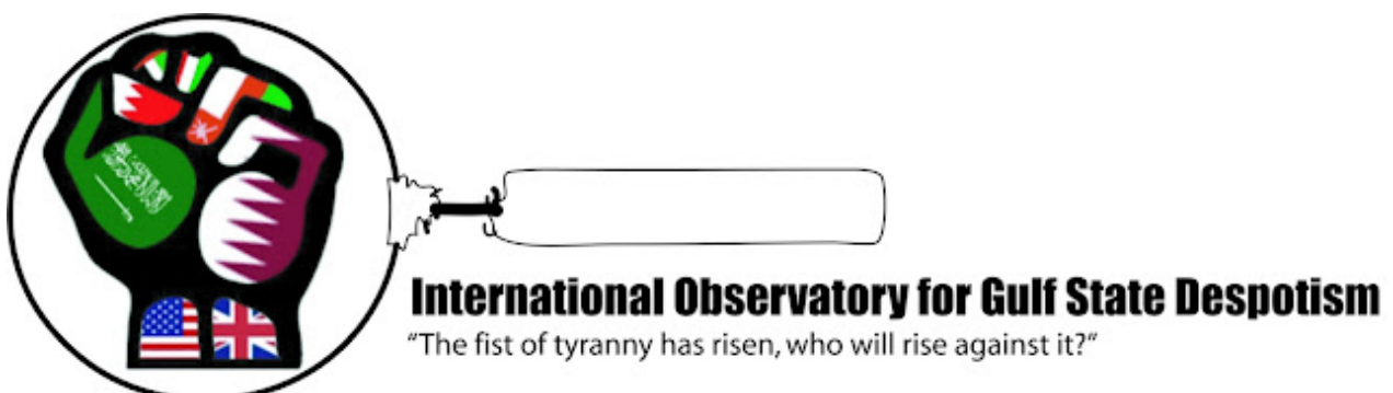
Image: The Fortune 500 has an array of faux-human rights organizations from North Africa

The key to breaking this self-imposed Western media blockade is for the alternative media to conduct the research and cover developments themselves. This includes reaching out to activists and reformers within Saudi Arabia, Qatar, and the other GCC autocracies and giving the people the platform denied to them by the corporate-funded Western media.