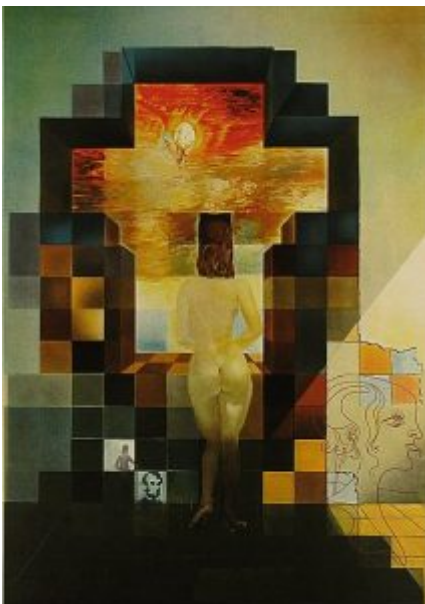
Lincoln in Dali-vision