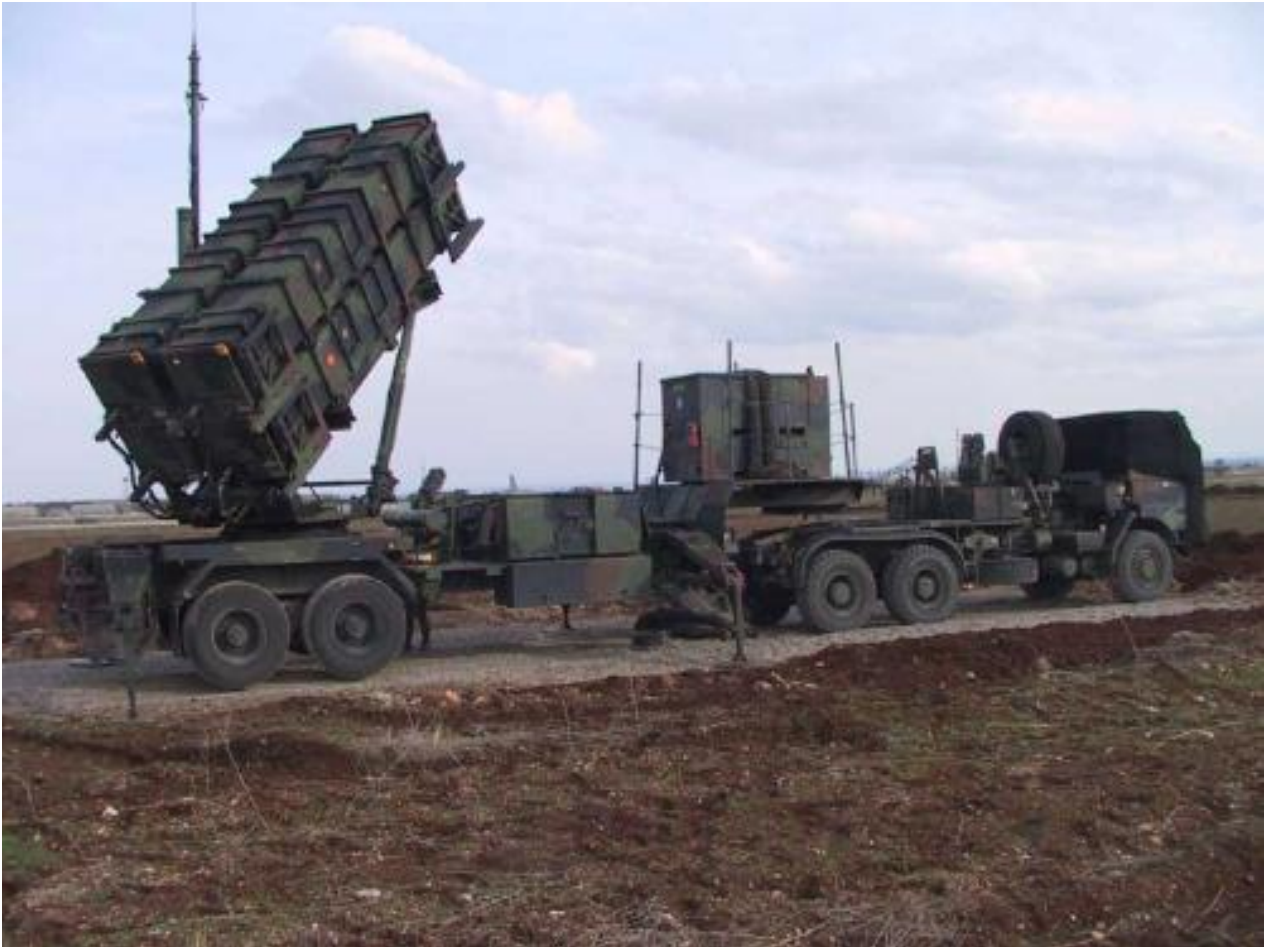
Image: A Patriot missile system. NATO Source Alliance News Blog reported on November 4, 2012, "Turkey plans to officially request NATO deploy a Patriot missile defense system in its territories as a security precaution against a potential large-scale military offensive from Syria as Syrian shelling on the border raises tensions." Now this request is being repurposed to enact a defacto "no fly zone" over northern Syria - illustrating the duplicitous nature of reports/initiatives coming out of NATO members as they once again attempt to creep their way toward unwarranted military intervention.

Turkey is implicated by the above mentioned Saban Center itself, as a necessary component in joint Turkish-Israeli cooperation to press Syria's borders to trigger dissent amongst Syria's military ranks.