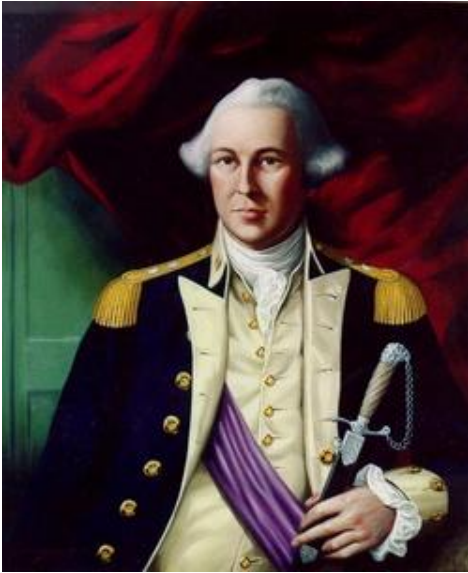
General Joseph Warren

All US Masonic lodges are to this day warranted by the British Crown, whom they serve as a global intelligence and counterrevolutionary subversion network.