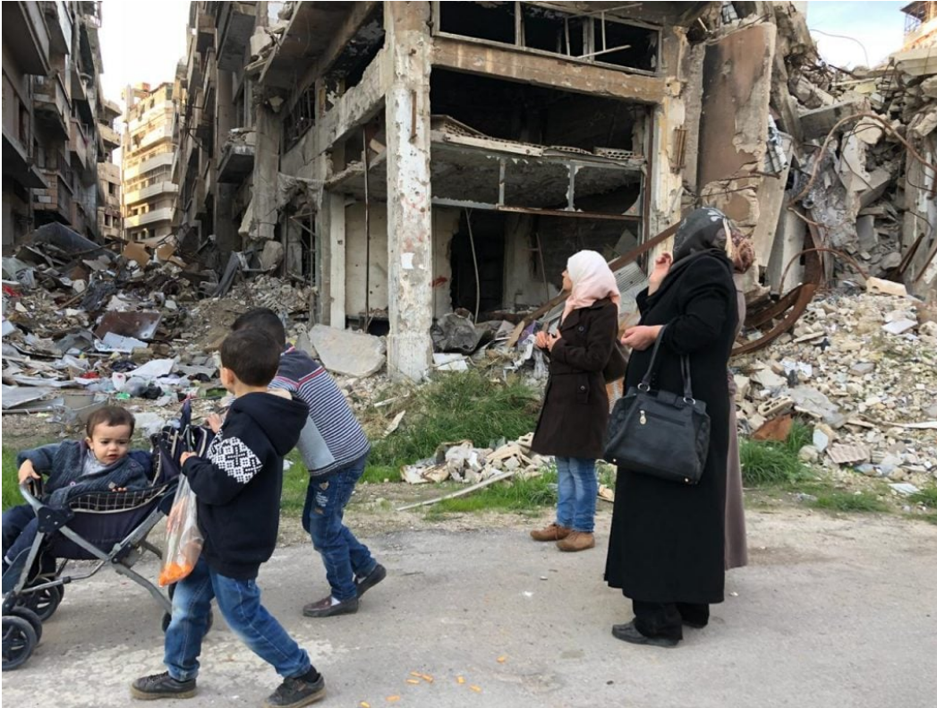
Families visiting their destroyed streets in Homs

The destruction of several parts of the city is so severe that it resembles the surface of another planet, or a fragment from some apocalyptic horror film.