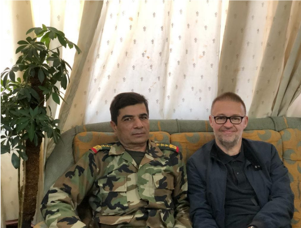
Syrian General, Akhtan Ahmad

"It is safe," smiles General Akhtan Ahmad, proudly. "You know it is safe, don't you?"