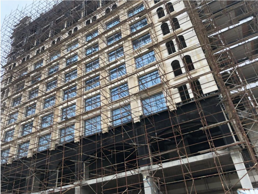
New hotel constructed in Damascus

I sit with my friends, Yamen and Fida, in a classic, old Damascus café, called Havana. It is a real institution; a place where Ba'ath Party members used to meet, during the old and turbulent days. Photographs of President Bashar al-Assad are displayed, prominently.