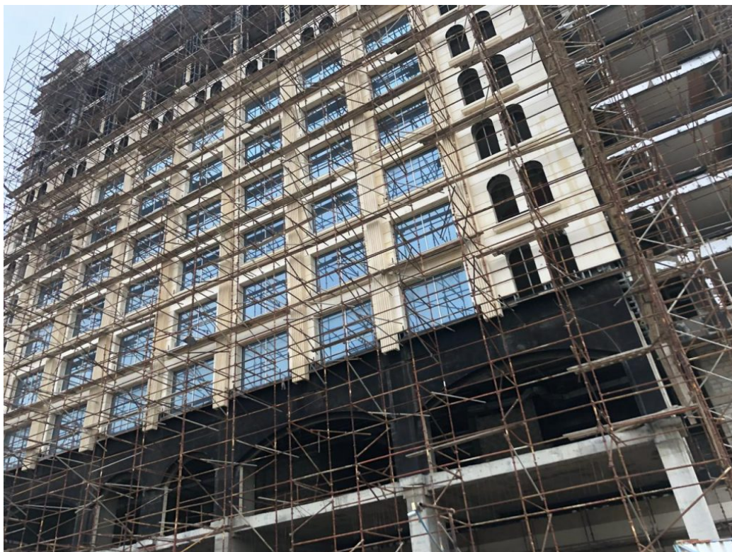
New hotel constructed in Damascus

I sit with my friends, Yamen and Fida, in a classic, old Damascus café, called Havana. It is a real institution; a place where Ba'ath Party members used to meet, during the old and turbulent days. Photographs of President Bashar al-Assad are displayed, prominently.