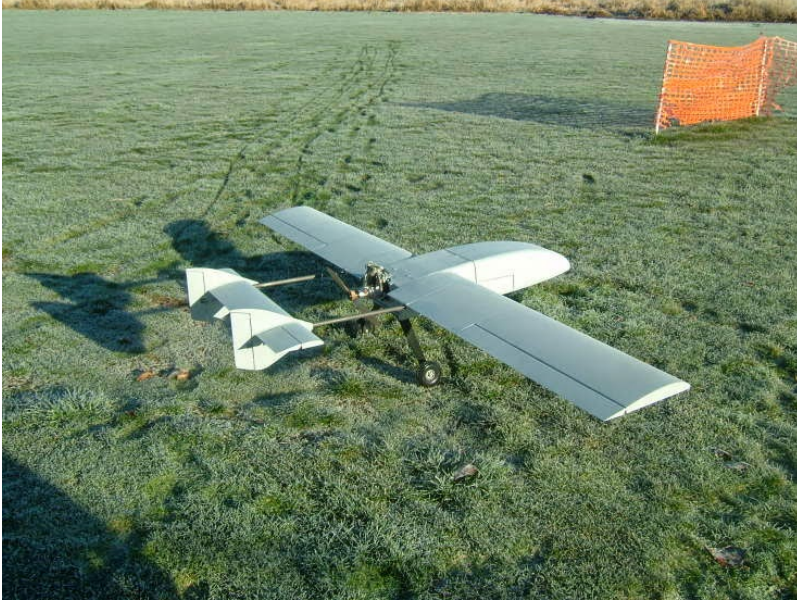
Image: A DIY drone looking very similar to military design

sking for drones to be regulated or otherwise “outlawed” will only result in the technology remaining solely in the hands of those abusing it most. Instead, activists fearing a dystopian future where drones prowl the skies and strike us down without warning and with absolute impunity, should commit themselves to democratizing drone technology - in other words - taking ownership over it and ensuring no monopoly of any kind can be had over it.