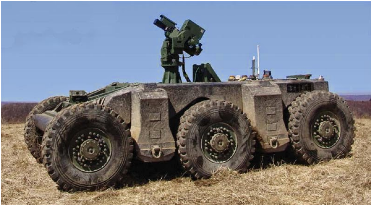
Image: Drone technology doesn't just apply to aerial platforms, but also to ground vehicles. Mastery of automating or remote controlling mobile systems of every kind can either be a benefit or bane to society - a fate that depends entirely on whether the people democratize this technology through direct action and technological collaboration, or allows it to continue being monopolized by corporations, armies, and governments

The watchers can be watched, the trackers can be tracked, and the executioners can be eliminated - but only if drone technology can be embraced and democratized, not feared and allowed to remain monopolized. When we do grant ourselves the ability to watch, track, and eliminate the drones sent to watch, track, and eliminate us, we may find the balance of power such an ability achieves makes actual confrontation entirely unnecessary - for it was the ancient Chinese warlord Sun Tzu who said best, "The greatest victory is that which requires no battle."