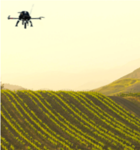
Image: Drone-borne agricultural imaging.

Drones can provide farmers with three types of detailed views. First, seeing a crop from the air can reveal patterns that expose everything from irrigation problems to soil variation and even pest and fungal infestations that aren't apparent at eye level. Second, airborne cameras can take multispectral images, capturing data from the infrared as well as the visual spectrum, which can be combined to create a view of the crop that highlights differences between healthy and distressed plants in a way that can't be seen with the naked eye. Finally, a drone can survey a crop every week, every day, or even every hour. Combined to create a time-series animation, that imagery can show changes in the crop, revealing trouble spots or opportunities for better crop management. Drones are being deployed agriculturally by independent farmers to give them a better idea of how their crops are fairing and insight on how to better manage their fields with the resources they have or may require. MIT's Technology Review, in an article titled, " Agricultural Drones ," stated: