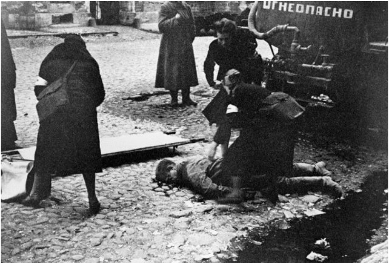
Nurses assisting the wounded during the first bombardment