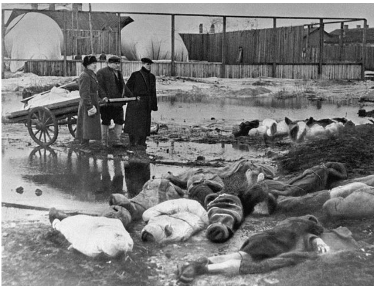
The Volkovo cemetery

“I am still alive and able to write in my diary. I’m no longer convinced at all that Leningrad won’t be abandoned. So much has been said, we’ve heard so many fine words and speeches: Kiev and Leningrad are impregnable fortresses!!!... Never will a fascist set foot in the flourishing capital of the Ukraine, never will he be able to enter our country’s northern pearl, Leningrad. But today it was reported on the radio ... after several days of bitter fighting our army ... withdrew from Kiev! What does this mean? No one can understand it.” [pp. 115-16]