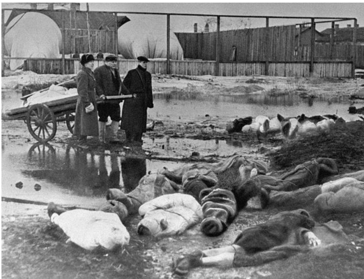
The Volkovo cemetery

“I am still alive and able to write in my diary. I’m no longer convinced at all that Leningrad won’t be abandoned. So much has been said, we’ve heard so many fine words and speeches: Kiev and Leningrad are impregnable fortresses!!!... Never will a fascist set foot in the flourishing capital of the Ukraine, never will he be able to enter our country’s northern pearl, Leningrad. But today it was reported on the radio ... after several days of bitter fighting our army ... withdrew from Kiev! What does this mean? No one can understand it.” [pp. 115-16]