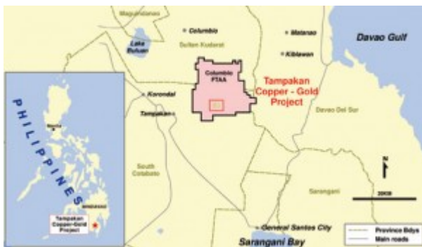
Tampakan Mining

the mines, including some women becoming prostitutes, reportedly driven to it by the combination of their family's loss of land, livelihood and influx of men working in the mines" (Salamat, 2013).