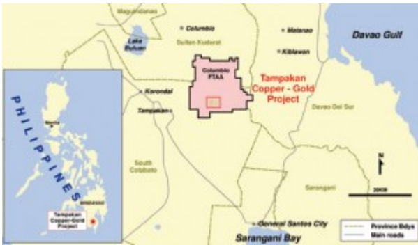
Tampakan Mining

mining bewail the loss of their former livelihood in fishing, agriculture and forestry, “as some of them were forced to become mineworkers instead, or service workers for those at work in the mines, including some women becoming prostitutes, reportedly driven to it by the combination of their family’s loss of land, livelihood and influx of men working in the mines” (Salamat, 2013).