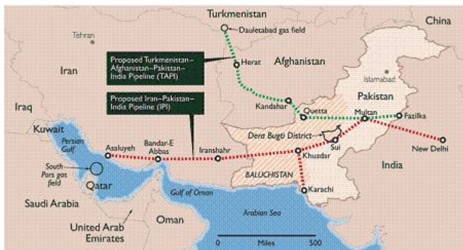
Map 1 • B.2139 heritage.org