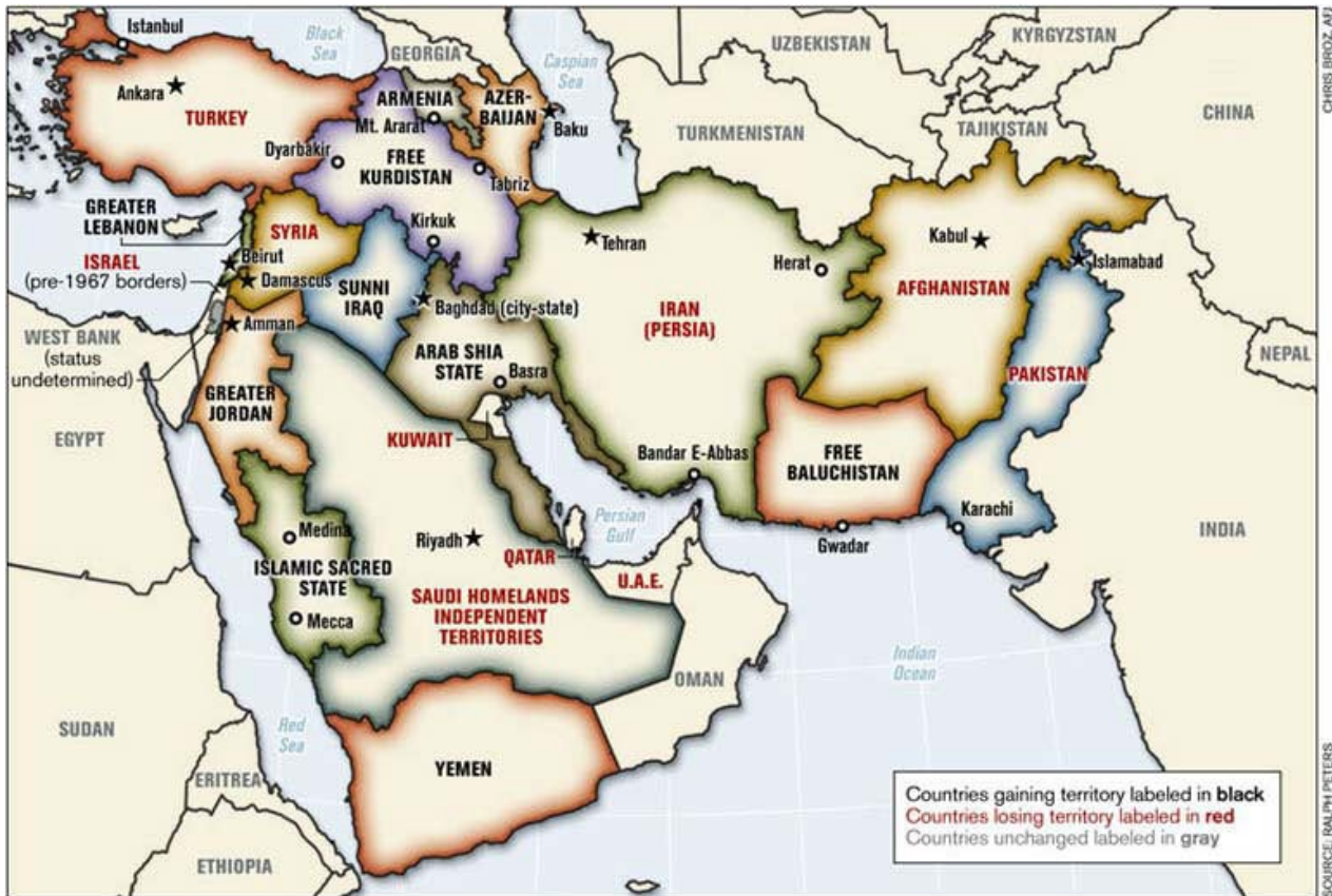
Map: click to enlarge

Note: The following map was prepared by Lieutenant-Colonel Ralph Peters. It was published in the Armed Forces Journal in June 2006, Peters is a retired colonel of the U.S. National War Academy. (Map Copyright Lieutenant-Colonel Ralph Peters 2006).